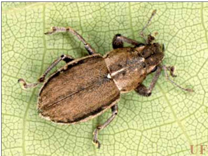
Figure 1. Dorsal view of an adult female whitefringed beetle, Naupactus sp.