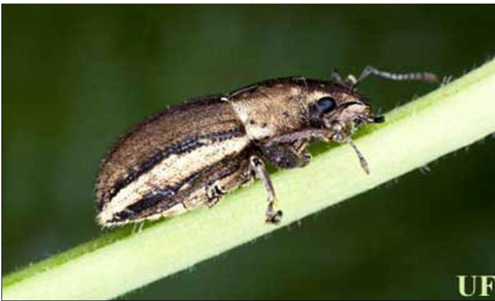
Figure 3. Lateral view of an adult female whitefringed beetle, Naupactus sp.