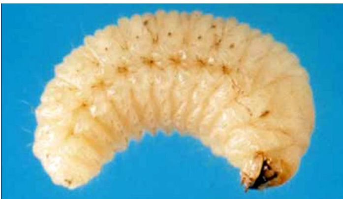
Figure 4. Larva of a whitefringed beetle, Naupactus sp.

Mature larva about 12 mm long; creamy yellowish-white; C-shaped with a strong thoracic swelling.