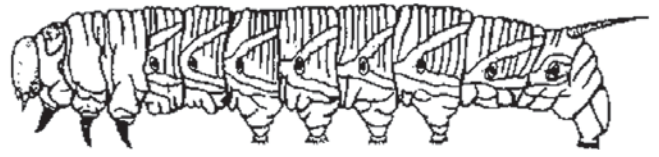
Figure 5. Tomato hornworm larva.

oblique lateral bands it bears eight whitish or yellowish “V”-shaped marks laterally, and pointing anteriorly (Figure 4). The “V”-shaped marks are not edged in black. Also, in tomato hornworm the “horn” tends to be black in color. There normally are five instars, but occasionally six are observed. Corresponding mean larval body lengths are 6.7, 11.2, 23.4, 49.0, and 81.3 mm, respectively. Larval development time averages about 20 days.