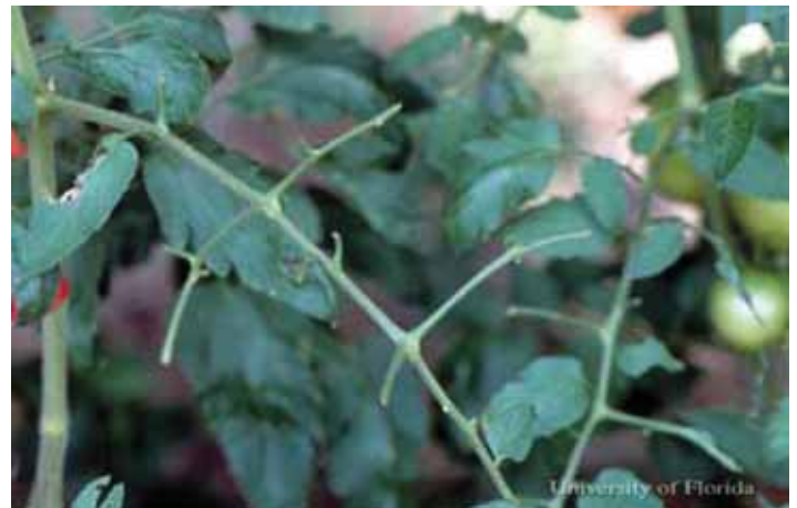
Figure 11. Defoliation of a tomato leaflet caused by tobacco hornworm, Manduca sexta (Linnaeus). Credits: James Castner, UF/IFAS

Larvae are defoliators, usually attacking the upper portion of plants initially, and consuming foliage, blossoms, and green fruits. They usually consume the entire leaf. Because the larvae of hornworms attain such a large size, they are capable of high levels of defoliation. About 90% of the foliage consumption occurs during the final instar. Larvae blend in with the foliage and are not easy to detect. Thus, it is not surprising that they often are not observed until they cause considerable damage at the end of the larval period. Hornworms are not considered to be pests of commercial crops in Florida and only occasionally damage garden crops, probably due to the activities of natural enemies.