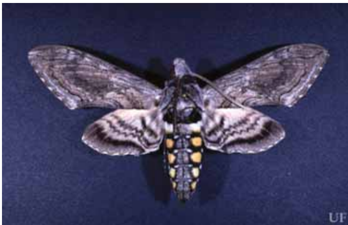
Figure 9. Adult tomato hornworm, Manduca quinquemaculata (Haworth).

Adults: The adults of both species are large moths with stout, narrow wings, and a wing span of about 100 mm. The forewings are much longer than the hind wings. Both species are dull grayish or grayish brown in color, though the sides of the abdomen usually are marked with six orange-yellow spots in tobacco hornworm (Figure 8) and five spots in tomato hornworm (Figure 9). The hind wings of both species bear alternating light and dark bands.