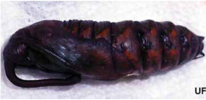
Figure 8. Late pupa stage of the tomato hornworm, Manduca quinquemaculata (Haworth).

Adults: The adults of both species are large moths with stout, narrow wings, and a wing span of about 100 mm. The forewings are much longer than the hind wings. Both species are dull grayish or grayish brown in color, though the sides of the abdomen usually are marked with six orange-yellow spots in tobacco hornworm (Figure 8) and five spots in tomato hornworm (Figure 9). The hind wings of both species bear alternating light and dark bands.