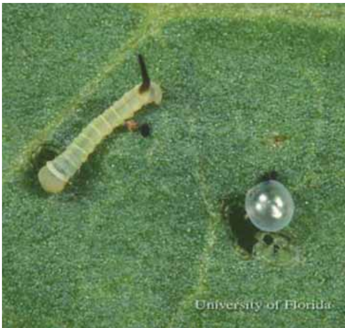
Figure 1. Newly hatched tobacco hornworm, Manduca sexta (Linnaeus), larva and egg.

Tobacco and tomato hornworms are common large caterpillars that defoliate tomato plants. Their large size allows them to strip a plant of foliage in a short period of time, so they frequently catch gardeners by surprise. They are quite similar in appearance and biology.