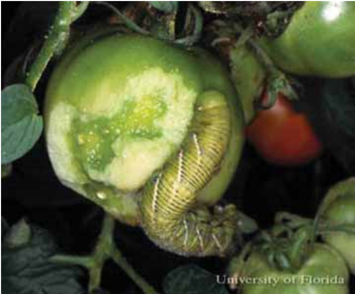
Figure 12. Damage to tomato fruit caused by tobacco hornworm, Manduca sexta (Linnaeus).