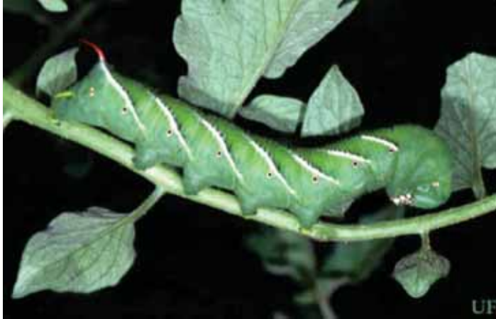
Figure 2. Larva of tobacco hornworm, Manduca sexta (Linnaeus).

Pupa: Mature larvae drop to the soil at maturity and burrow to a depth of 10 to 15 cm, where they form a pupal cell. The pupa is large and elongate-oval in form, but pointed at the posterior end. It measures 45 to 60 mm in length. The pupa bears a pronounced maxillary loop, a structure which encases the mouthparts. The maxillary loop in tobacco hornworm (Figure 5) extends back about one-fourth the length of the body, whereas in tomato hornworm it is longer, usually extending for about one-third the length of the body (Figure 6). The color of the pupa is brown or reddish brown (Figure 7). Duration of the pupal stage is protracted and variable.