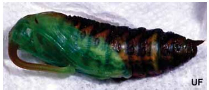
Figure 7. Newly formed pupa of the tomato hornworm, Manduca quinquemaculata (Haworth).