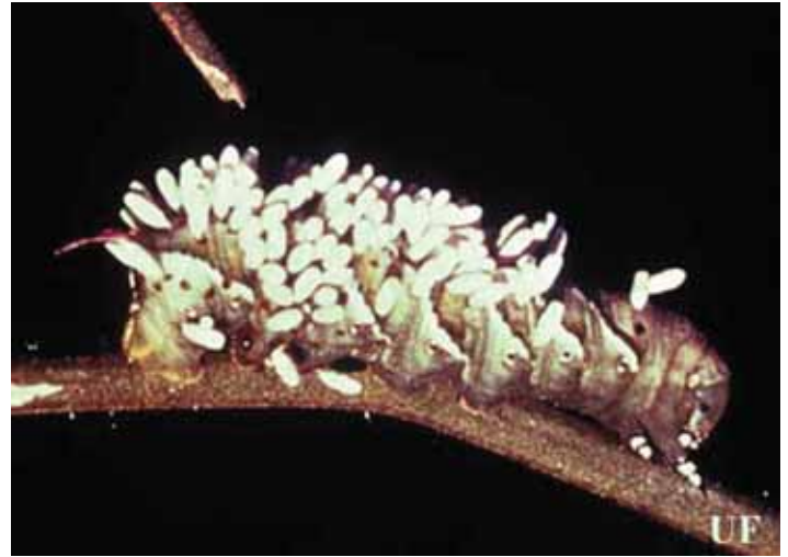
Figure 13. Even though it is still capable of movement, this hornworm larva is already “dead.” The white capsules on its back, frequently mistaken for “hornworm eggs” by many gardeners, are actually Hymenopterous wasp pupae of the Braconidae family. These wasps fed on the hornworm while in the larval stage and are now pupating into adults. When home gardeners find hornworms in this stage, they should let them be as they are not capable of more damage. And when they emerge, the adult wasps will hunt for other hornworms to parasitize.

Biological control: Natural enemies of these pests are abundant (Figure 10). Polistes spp. wasps prey on the larvae and several wasp parasitoids (e.g., Trichogramma spp., Cotesia congregata , Hyposoter exigua ) are sometimes effective. In Florida, Trichogramma pretiosum was released to control larvae at a rate of 378,000/acre at 3-day intervals and high levels of egg parasitism were attained.