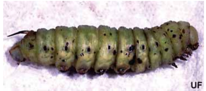
Figure 6. Prepupa of the tomato hornworm, Manduca quinquemaculata (Haworth).