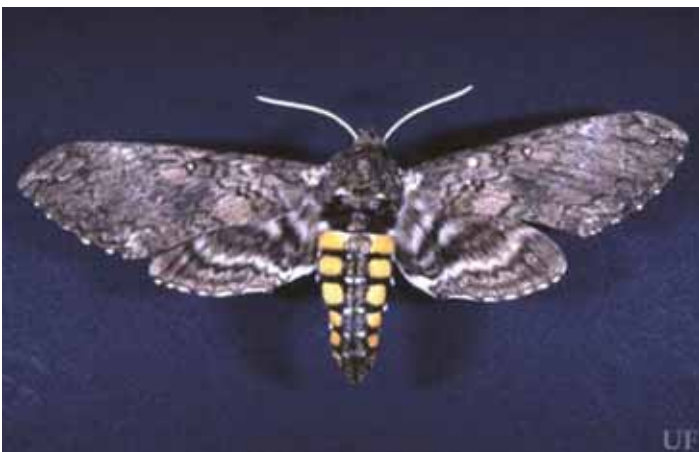
Figure 10. Adult tobacco hornworm, Manduca sexta (Linnaeus).