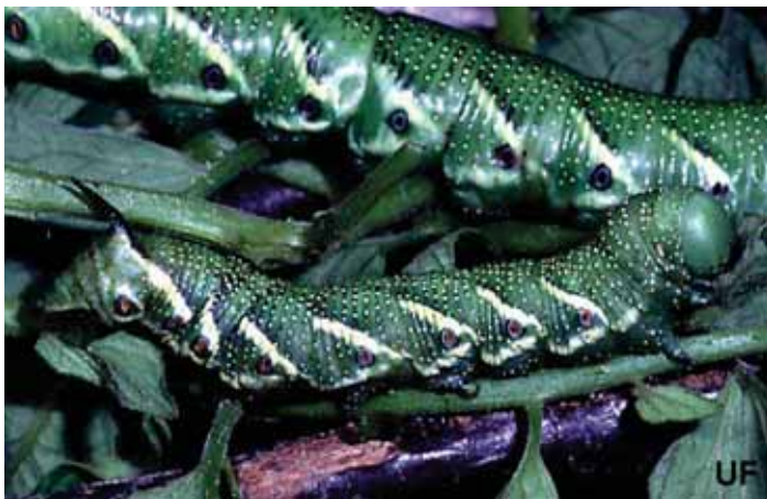
Figure 4. Last instar larva of the tomato hornworm, Manduca quinquemaculata (Haworth).