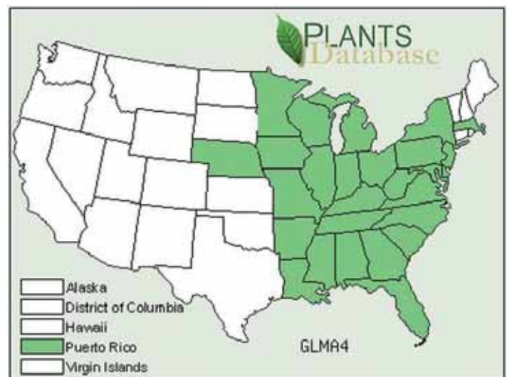
Figure 1. Occurrence of Glycine max in the US.

cattle feed. Production facilities can be put in place fairly quickly for this energy source. Several small facilities are already up and running in the Southeast with most being located in the mid-west.