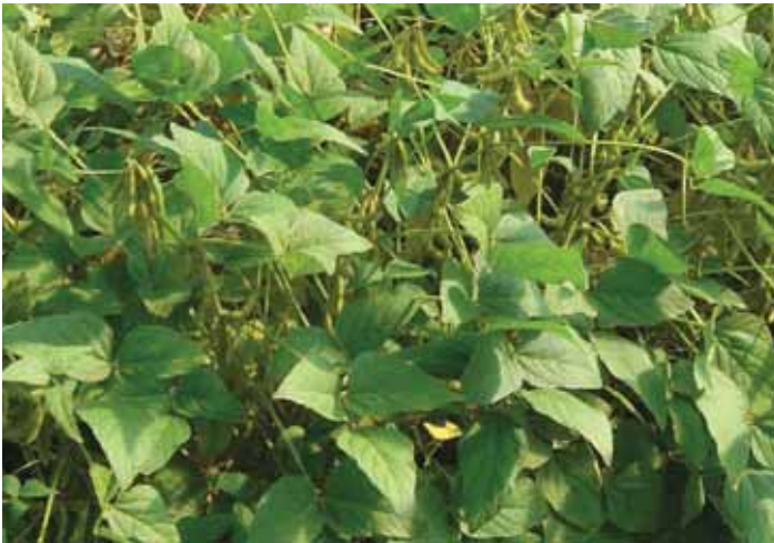
Figure 2. Soybean in vegetative state.

done as this requires specific infrastructure. Oil extracted from soybean can be washed with water and undergoes an esterification process which removes glycerin and allows the oil to perform like traditional diesel in commercial processing. Initially most of this biodiesel may be destined for use in farm equipment, but US automakers are now allowing as much as 20% to be used in diesel engines in passenger vehicles, which will create more demand for diesel as well as biodiesel. Many tractor manufacturers already have warranties on tractors that use blends up to 5–20% biodiesel. Biodiesel provides power similar to conventional diesel fuel, is cleaner burning and has a higher lubricating effect than petroleum diesel.