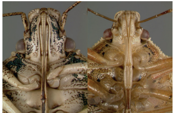
Figure 5. Comparison of the mouthparts of a plant feeding stink bug versus a predatory stink bug. On the left is a plant feeding stink bug, Halyomorpha halys , with a long and slender beak. On the right is a predatory stink bug, Podisus maculiventris , with a stout and robust beak.