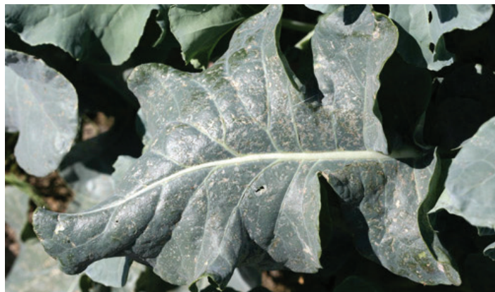
Figure 8. Feeding damage on broccoli leaves by Bagrada hilaris .

of leafy crucifers like broccoli, cabbage, and cauliflower (Palumbo and Natwick 2010). Damaged apical meristems may result in adventitious bud break, stunting, and development of small unmarketable heads at the lateral parts of the plant. Crops including broccoli, cauliflower, and head cabbage may not produce any heads at all due to the damage, a condition known by farmers as “blind” plants.