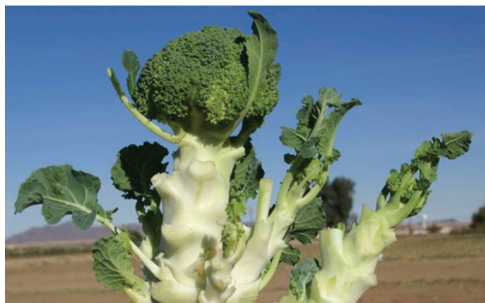
Figure 9. Bagrada hilaris feeding damage resulting in unmarketable broccoli plant with small multiple crowns.