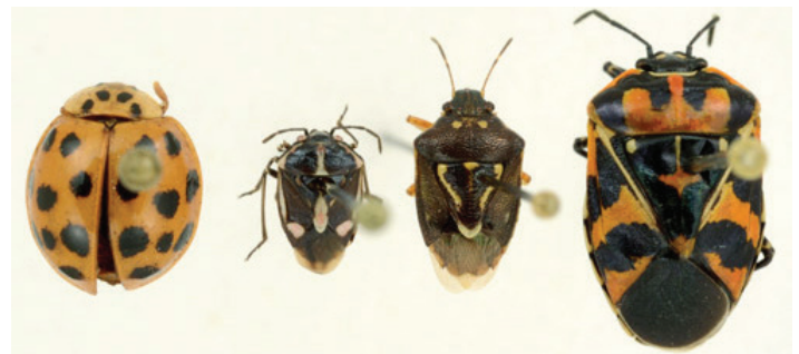
Figure 4. Species similar in appearance to the bagrada bug, Bagrada hilaris . From left to right: Harmonia axyridis , Bagrada hilaris , Mormidea pama , and Murgantia histrionica .

The early nymphs of two predatory stink bugs found in Florida, the spined soldier bug ( Podisus maculiventris Say), and the Florida predatory stink bug, Euthyrhynchus floridanus , (L.), closely resemble the nymphs of bagrada bugs. These two predatory stink bugs should be fairly easily distinguished from the bagrada bug because the predatory stink bugs are larger and have a stout and robust rostrum as opposed to the long, slender rostrum associated with herbivorous stink bugs.