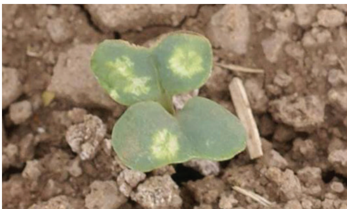
Figure 6. Bagrada hilaris feeding damage on cotyledons of broccoli seedling.

Typical of plant feeding stink bugs, bagrada bugs cause physical damage through piercing-sucking mouthparts. The cotyledon stage of direct-seeded plants in the field is the most susceptible stage to feeding damage; however, a high preference for the four-leaf-stage of broccoli plants has been observed in laboratory trials (Huang et al. 2014b). Short periods of infestation during the early stage of plant development results in loss of total leaf area and a reduction in chlorophyll content, which may be part of a feeding-induced stress response (Huang et al. 2014a). The insects feed on both surfaces of the leaves, and presumably inject saliva to aid in breaking down the inner leaf tissue (Palumbo and Natwick 2010).