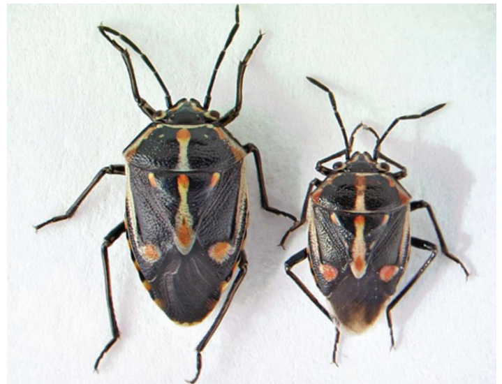
Figure 1. Dorsal view of Bagrada hilaris ; adult female (left), and adult male (right).

(Azim and Shafee 1986; Horvath 1936; Rebagliati et al. 2005)