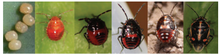
Figure 2. Life stages of the bagrada bug.

Oviposition typically occurs on the undersides of cotyledons, leaves, stems, and in the soil near the base of plants (Reed and Perring 2012, Palumbo and Natwick 2010). Eggs are commonly laid singly and close together. However, the eggs may be laid in nearly linear clusters consisting of approximately 10 eggs. Each adult female can produce over 100 eggs during a season (Hill 1975). Eggs have an opaque, white to light red hue, and nymphs emerge after approximately 3 to 4 days during optimal temperature conditions (Reed and Perring 2012). In laboratory studies, the eggs begin to appear pink within 2–3 days and can incubate after 3 days at 35.8°C (96°F), and as long as 6 days at 25.6°C (78°F) (Singh and Malik 1993).