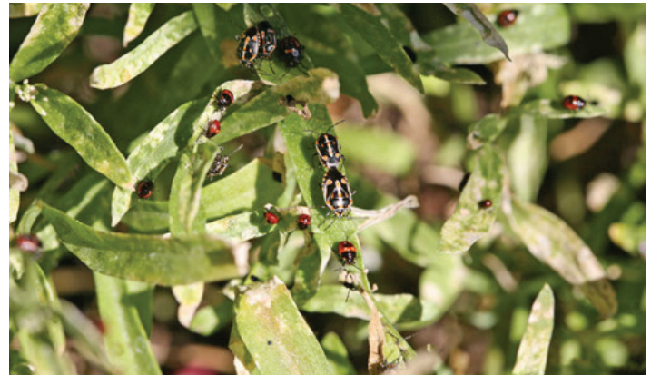
Figure 3. Bagrada hilaris adults and nymphs on Alyssum.

Bagrada bugs have five nymphal stages (Singh and Malik 1993). Newly emerged first instars are bright red and have a slightly darkened to black coloration on the pronotum, head, legs, and antennae; the abdomen remains reddish and develops some black bands and white dots as the early nymphal stages advance. The bodies of late instars are darker and may still have pale to dark red markings. Similar to other plant-feeding stink bugs, the first instar nymph will remain on or near the egg it emerged from and does not feed until after molting into a second instar.