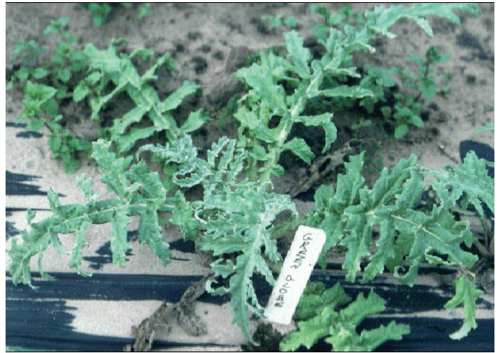
Figure 2. Green globe artichoke

An artichoke is ready for harvest when it has reached maximum size, but before the bracts open. Cut the top one first, then the secondary ones as they mature. Store at low temperatures (near 32°F) and high humidity (95% RH). In addition to minerals and vitamins, artichokes contain about 3% protein and 0.2% fat.