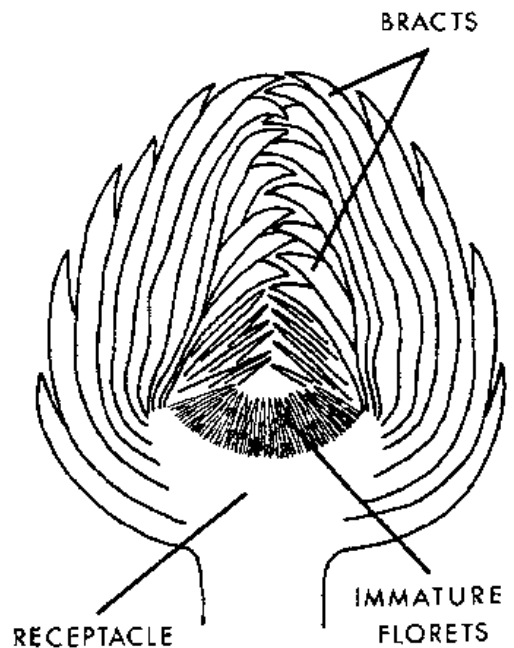
Figure 1. Artichoke interior Credits: James M. Stephens

Almost all the nation's globe artichokes are grown in a narrow coastal area of California because of the favorable climate. Artichokes do best in a frost-free area with cool, foggy summers. They do not overwinter in areas with deep ground freezes and are not well adapted to Florida's climate because hot weather opens buds quickly, destroying tenderness of edible parts. Brief periods of exposure to temperatures past below freezing cause no apparent damage.