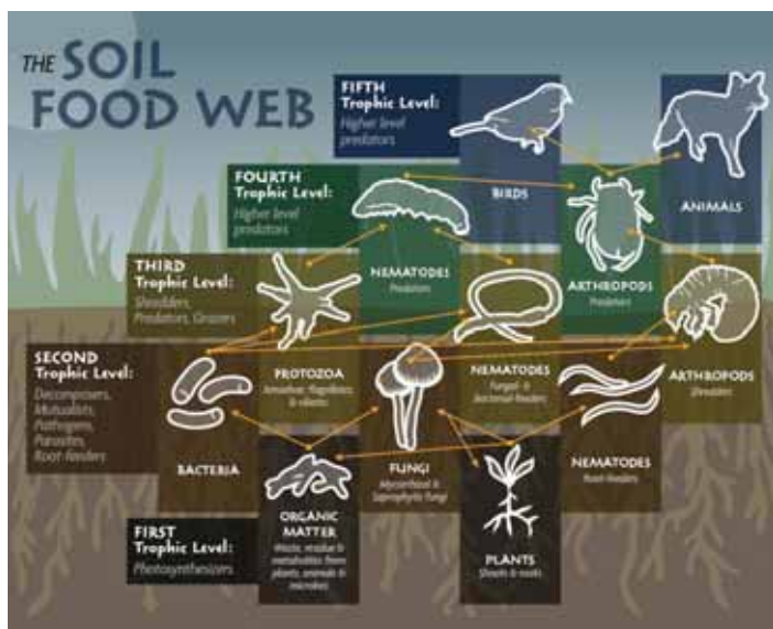
Figure 7. Components of the soil food web (Ingham 2000).

Healthy soils are critical to build a strong ecosystem and to support wildlife in the landscape (Figure 7). Soils in most new construction sites contain low populations of soil microorganisms. A healthy soil contains a rich mixture of plant (flora) and animal life (fauna). These organisms help decompose organic matter, cycle nutrients in the soil, and retain nutrients for plant uptake. An active soil ecosystem can help reduce the amount of fertilizers required in the landscape. As organic matter and plant materials decompose, they provide food for nematodes, fungi, and bacteria that form the base of the food web.