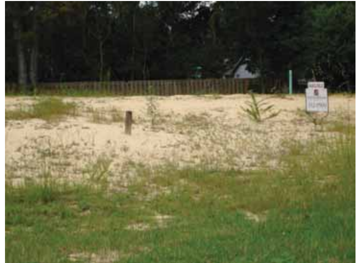
Figure 1. Fill sand is often piled on construction sites to serve as a base for the home's foundation.

and can be easily compacted (Figure 3). Soils with high amounts of clay can lead to poor root development (Figure 4) and are susceptible to standing water during much of the year. This leads to waterlogging of the soil and root rot. Prior to landscape installation, a thin layer of topsoil is commonly applied on top of the fill material to aid in plant establishment, but the underlying soil problems remain.