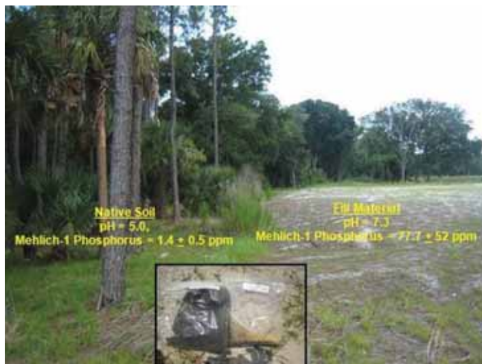
Figure 6. Comparison between native soil and fill material pH and Mehlich-1 extractable phosphorus. The insert image shows samples collected from the upper six inches of the two areas to illustrate the dramatic difference in organic matter content.

be a dramatic difference in the pH and nutrient availability of native soils and fill material (Figure 6).