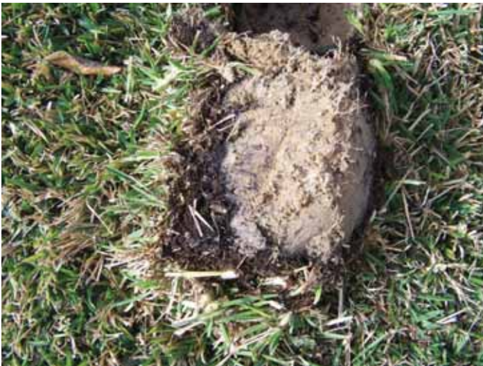
Figure 4. Stormwater pond dredging is often used as a fill on home construction sites. These heavy clay soils cause poor root development.

Finally, the soil at the home site may contain other construction debris such as wire, wood, nails, asphalt paper, and concrete shards. These materials can restrict plant root development for newly established landscape plants.