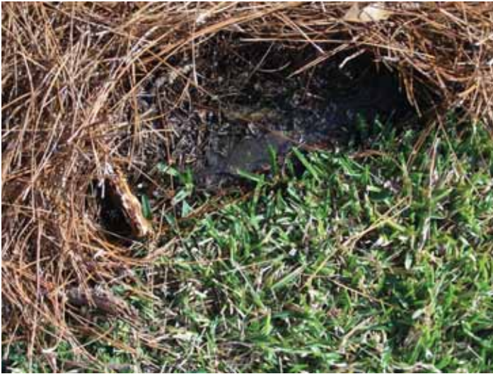
Figure 3. Clay soils do not drain well, causing standing water.