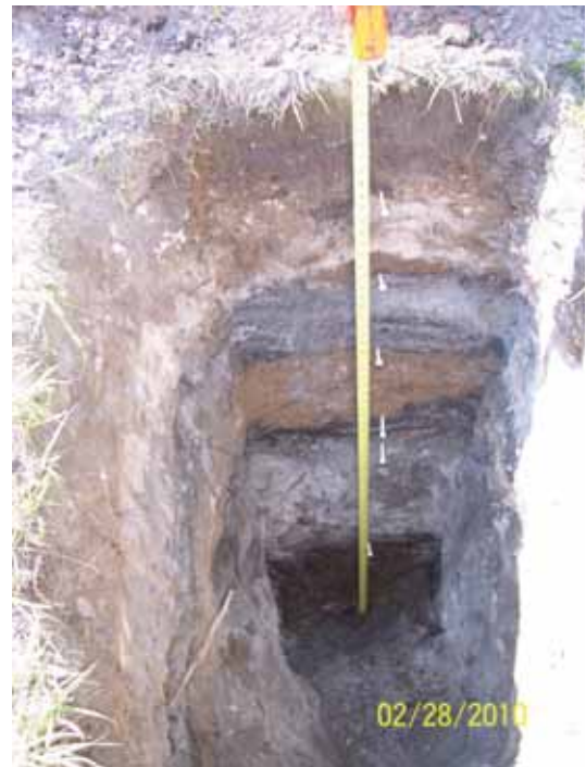
Figure 2. Fill sand is typically added to a construction site to raise the elevation, resulting in the burial of the native soil profile. In this picture, note that various fill materials were applied in layers to establish the final grade.