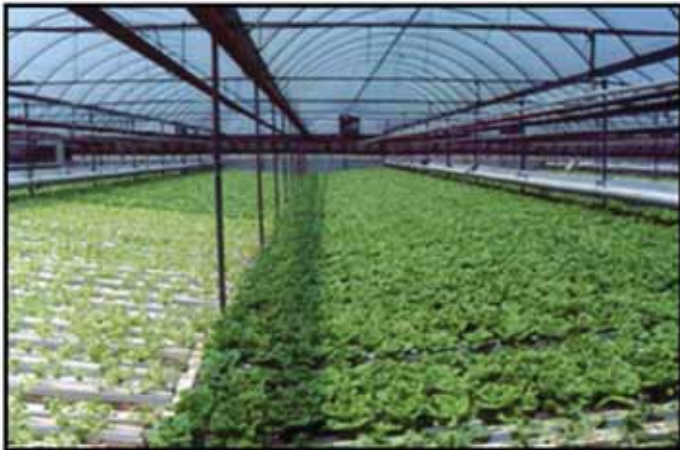
Figure 3. Bibb lettuce growing in a hydroponic system that uses nutrient film (flow) technique in a greenhouse in Live Oak, FL, 1995.

The nutrient film technique (NFT) is a water-culture technique that uses no media. Plants are grown with roots contained in a plastic film, trough or PVC pipe (Figure 3). Nutrient-laden water is re-circulated through the system, bathing the roots. This system is still popular for short-term crops, such as lettuce and basil, where the plants are sold with the roots intact. This system was also popular in the 1990s for several small-farm tomato operations.