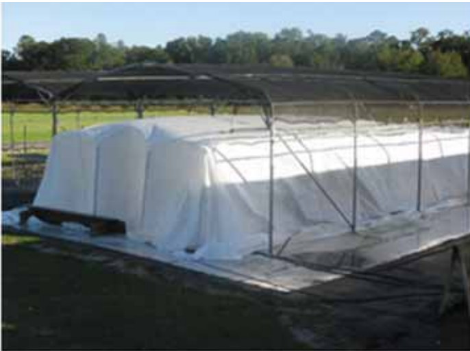
Figure 8. A tomato crop under a polypropylene frost cover outdoors in December, 2008, in Live Oak, FL.

However, Florida's mild climate also provides opportunities for hydroponic growing systems to be used successfully outside. The following two illustrations—figures 8 and 9—picture outdoor hydroponic systems in Live Oak, FL.