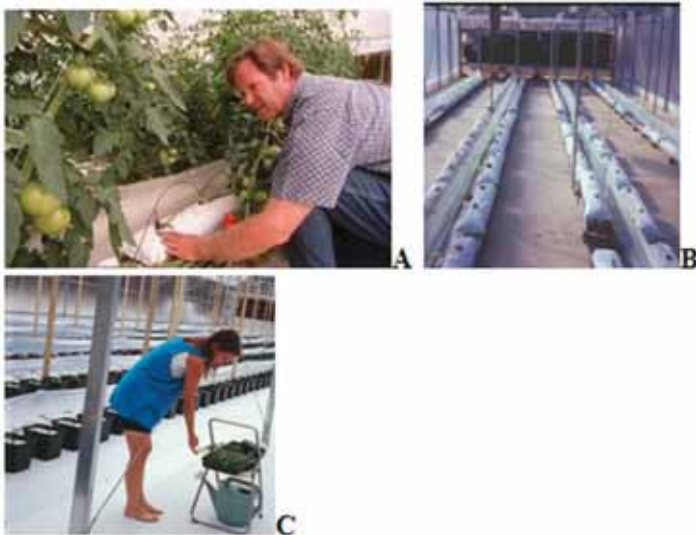
Figure 1. Photos A and B, taken in 1995 in a greenhouse at UF's North Florida Research and Education Center in Live Oak, FL, show a perlite lay-flat-bag system. Photo C pictures a Dutch-bucket system in a greenhouse in Sanford, FL, in 2004.

Perlite systems for growing vegetables hydroponically are varied in design. One system uses drip-irrigated, perlite-filled, lay-flat plastic bags. (See Figure 1). These cigar-shaped bags are placed in two rows, running the length of the greenhouse with access aisles in between. Slits are made at the bottom or slightly up one side of each bag for drainage to a central collection trough running between the rows. Effluent from the bags collects in the trough and may remain there or run by gravity to a collection tank.