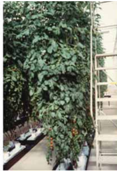
Figure 4. Rockwool hydroponic culture in a greenhouse in Lake Buena Vista, FL, 1998.

and used for another purpose, such as providing water and nutrients for an adjacent float system.