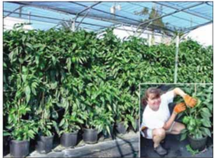
Figure 9. A hydroponic system outdoors, under shade, in Live Oak, FL, October, 2007.

Outdoor hydroponic systems typically are used with some provision for frost protection with row-cover materials. (See Figure 8). In addition, there is an increasing interest in extending the hydroponic growing season into the summer by using open shade structures (Hochmuth et al. 2007) to supply vegetables for local markets. (See Figure 9).