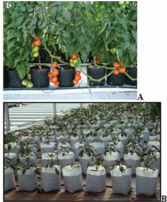
Figure 2. Tomatoes growing in media-filled, plastic nursery pots (A) and in upright bags (B) in a greenhouse in Wellborn, FL, in 2001.

Media filled plastic nursery pots (Figure 2A) or upright bags (Figure 2B) can be spaced in two rows similar to lay-flat bag and rockwool culture. This system is similar to those used by ornamental growers in Florida, who grow drip-irrigated foliage or landscape plants in containers.