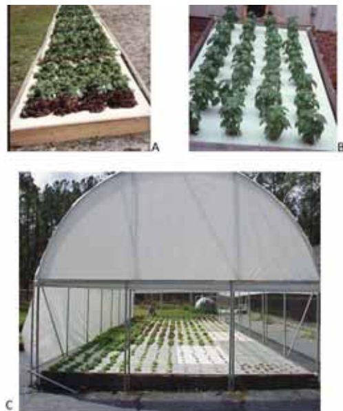
Figure 5. Floating raft hydroponic systems in Sanford, FL, 2007.

Floating raft hydroponic systems and vertical systems (see below) are popular, new hydroponic systems that were not even reported in 1991. The floating systems utilize the floating-raft or mat system, in which Styrofoam rafts with holes drilled in them are floated on nutrient-rich water (Sweat et al. 2003). This system works well with short-season, shallow-rooted crops—such as lettuce, basil, and watercress, which grow well under high-moisture conditions in the root zone. High-tech versions of this system can be expensive to build and operate, but low-tech versions have been tested and are in use on small farms in Florida (Figure 5).