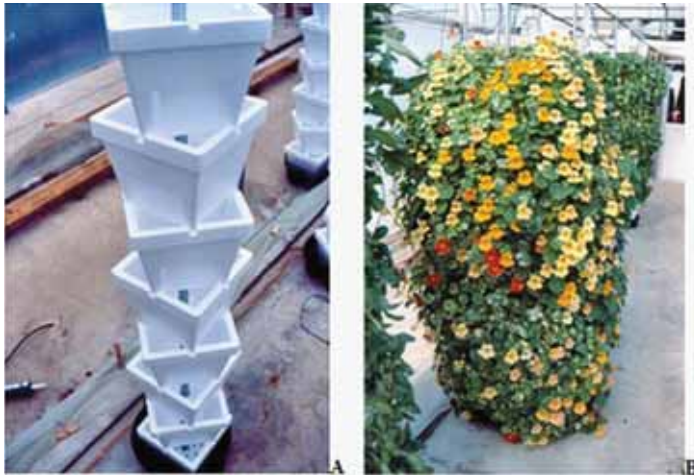
Figure 6. Verti-Gro® stacked pots (A) planted with nasturtium (B) in a vertical hydroponic system in Live Oak, FL, 2001.

Vertical hydroponic systems produce crops in upright or vertical rows, a method that can significantly increase plant populations. The most common vertical systems include stacked pots (Figure 6), stacked and sloped PVC pipes, and hanging vertical bags. The potential for increased yield in vertical systems is sometimes offset by the non-uniformity of product due to competition for light and space.