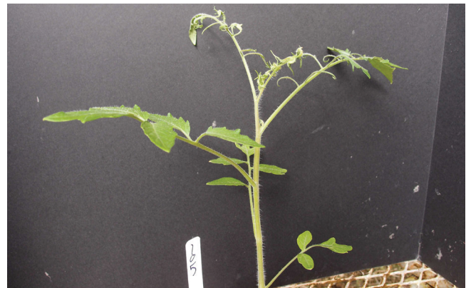
Figure 2. Low-dose aminopyralid damage on tomato. Note the damage is in the newest and most actively growing tissues.

Aminopyralid is a synthetic plant growth hormone that is highly mobile within the plant. Therefore, symptoms of aminopyralid often appear in the newest tissues and manifest as improper leaf formation and expansion (Figure 2). Higher concentrations will typically result in stem twisting or even root formation on the stems (Figure 3). Blooms (flowers) are quite sensitive to this herbicide and may abort even if leaf symptoms are not obvious.