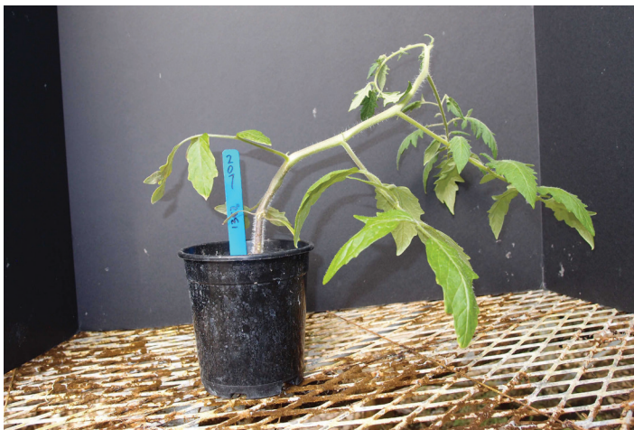
Figure 3. Higher doses of aminopyralid will result in leaf malformation and stem bending/twisting.