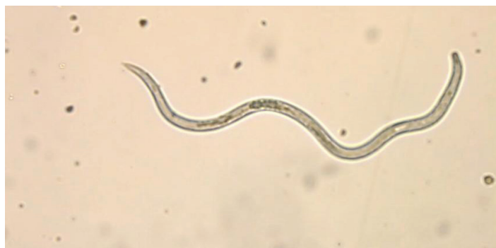
Figure 1. Aphelenchoides besseyi from strawberry. Plant City, 2016.

From the 1930's until the 1960's, crimp was frequently observed in commercial FL strawberry nurseries. Years when crimp did not show up were linked to low spring temperatures, setting of plants in new ground, and careful selection of nursery plants. There is no certainty about which species of Aphelenchoides caused crimp in Florida during those days. During the early years they were identified as A. fragariae , but in later reports starting around the 1950's there is no more mention of A. fragariae , instead the nematodes were now identified as A. besseyi . A. besseyi was first described in 1942 by J.R. Christei, so possibly the earlier reports were misidentifications. Very few reports exist on bud nematodes in FL strawberries after the 1970's. In 2014 the nematodes were reported from one farm (Noling, personal communication), and in 2016-17 they were found on six farms. The 2016-17 foliar nematodes were identified morphologically as A. besseyi (R. Inserra, FDACS, DPI, Gainesville, (R. Inserra, DPI, Gainesville, FL) (Figure 1). This identification was confirmed by molecular analyses of topotype populations of this species (Oliveira et al, 2019). Several other species of Aphelenchoides have since been identified from Florida strawberry fields, including a newly described species A. pseudogoodeyi which appears to be fungal-feeding and not cause damage to strawberry (Oliveira et al, 2019; Subbotin et al, 2020).