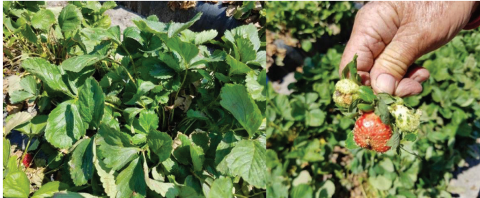
Figure 4. Aphelenchoides besseyi symptoms on strawberry. Left: twisting, crinkling and curling of strawberry leaves; right: abnormally shaped "broccoli" fruit. Plant City, FL, 2016–17 season.

Most nematodes in strawberry plants are found in the protected spaces at the bases of the young leaves and in the folds of the leaves in the bud. Brooks (1931) could artificially produce crimps by placing some of these nematodes in the buds of healthy plants. The time required for the symptoms to appear varied from 11 to 120 days, depending upon temperature, moisture, and whether or not the plant was putting on new foliage.