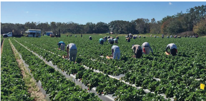
Figure 8. Harvest crew picking strawberries, moving up and down planting rows, Plant City, FL, 2017.

Foliar nematodes can also infest new plants by swimming up stems and moving along moist plant tissue surfaces. In some hosts they may also enter the leaves through stomata, but this has not been observed on strawberries. Foliar nematodes can mature from egg to adult in about 2 weeks, allowing many generations to develop during one growing season. Another potential means by which foliar nematodes are spread is through the harvesting process. Especially when plants are still wet from morning dew, the nematodes can easily be spread by the harvesting crew as they drag their hands through the planting rows while picking the berries (Figure 8).