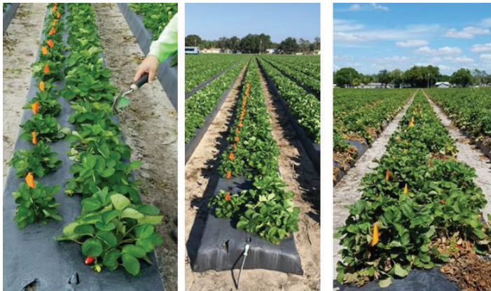
Figure 5. Foliar nematode symptoms on strawberry throughout the growing season; orange flags indicate nematode infection; same row is shown at different times; left, November 2016; middle, December 2016; and right, March 2017. Plant City, FL.

In the 2016–17 strawberry season, we observed a striking change in plant habit of nematode-infected strawberries throughout the growing season. Early in the season, A. besseyi -infected plants showed the typical crinkling and folding of leaves, and plants were compact and stunted. However, by the end of the season those same plants had become larger and greener as compared to non-infected plants (Figure 5).