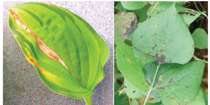
Figure 6. Aphelenchoides besseyi symptoms on Hosta spp. (interval lesions) and beans ("angular leaf spot", Costa Rica).

In other plants, foliar nematode symptoms often include localized chlorotic or purplish angular lesions that are delineated by leaf veins (it is difficult for the nematodes to move across the veins). This often creates a patch-like appearance on dicots and a stripe-like pattern with monocots (because monocots have parallel veins, discoloring on them looks like streaks) (Figure 6.) Discoloring typically starts near the leaf base and spreads outward. The symptoms of angular spots are often mistaken for bacterial leaf spots or fungal pathogens such as downy mildew which are also commonly confined between the leaf veins. In Costa Rica, A. besseyi has been reported to cause a disease of bean called angular leafspot (Figure 6).