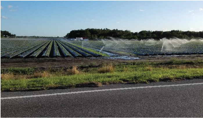
Figure 7. Overhead irrigation in strawberry field.

propagation of plants in spring and summer, the runners formed by crimped plants usually become infected as they push through the infected areas at the base of the leaves. This resulted in circular areas of diseased plants appearing in the nursery beds.