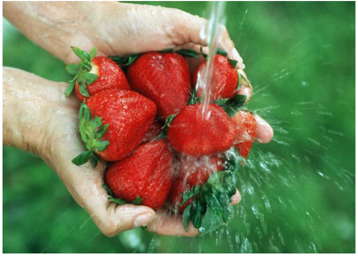
Figure 1. Florida strawberries are grown as an annual crop and harvested in late fall, winter, and early spring.

Temperatures between 50°F and 80°F (10°C and 27°C) and day lengths 14 hours or less are required for the development of flowers and fruit on most strawberry varieties. In areas of the United States north of Florida (except for the coastal areas of southern and central California), these conditions occur only for a short period in the late summer or early fall, and again briefly in the spring. In peninsular Florida, however, these conditions exist for much of the fall, winter, and spring. Single-crown (stem) strawberry plants are planted in Florida during the fall, from late September to early November. Flowering and fruit production generally begins in November and continues into April or May. Fruit production over this period is not constant, but occurs in two or three cycles, and can be interrupted by freezing weather. Because the highest quality fruit are produced on relatively young plants with not more than four or five branch crowns, plants are usually removed at the end of the fruiting season, and new plants are planted the following fall.