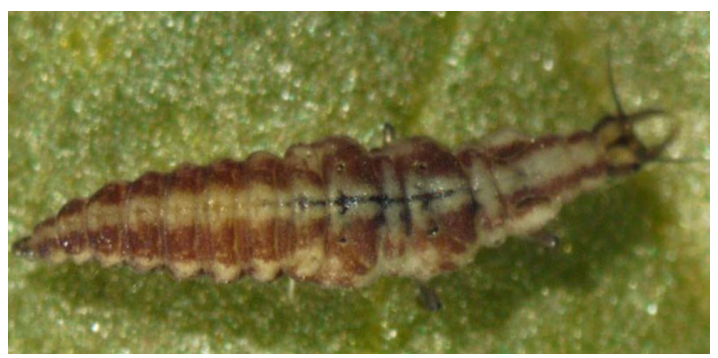
Figure 3. Lacewing larva. Lacewings feed on many pests of strawberry, including aphids.

are called "mummies" and have a distinctive appearance (Figure 5).