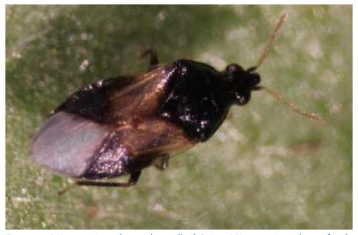
Figure 4. Minute pirate bug, also called Orius. Minute pirate bugs feed on thrips and other pests.