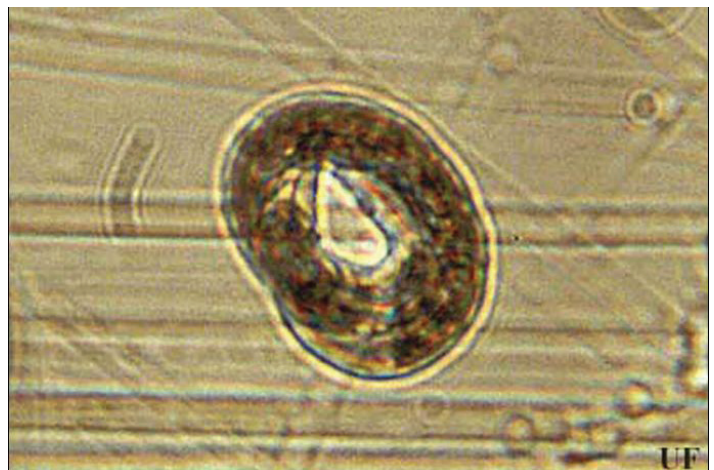
Figure 4. Reniform nematode, Rotylenchulus reniformis Linford & Oliveira, tightly coiled to undergo anhydrobiosis under drought conditions.