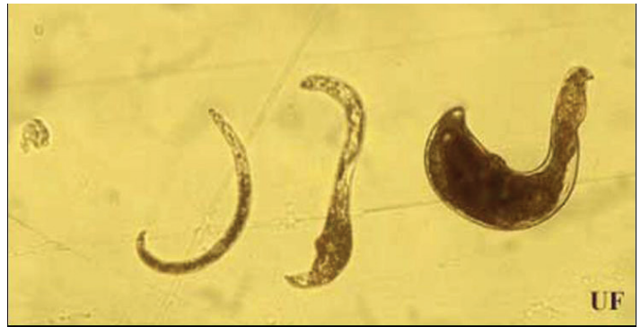
Figure 2. Life stages of reniform nematode, Rotylenchulus reniformis Linford & Oliveira. Ranging from left to right is egg, juvenile, young female with swollen body, and mature female in kidney shape.

Eggs hatch one to two weeks after being laid. The first-stage juvenile molts within the egg, producing the second-stage juvenile (J2) that emerges from the egg. The infective stage is reached one to two weeks after hatching. Once root penetration occurs, one or two more weeks are required for females to reach maturity. The male, which remains outside of the root, can inseminate the female before female gonad maturation. Sperm are stored in the spermatheca. Soon after female gonad maturation, the eggs are fertilized with sperm, and about 60 to 200 eggs are deposited into a gelatinous matrix. Typically, there is an equal number of females and males in a population. Some populations of reniform nematodes reproduce parthenogenetically (egg production without fertilization). The life cycle of this nematode is usually shorter than three weeks, but depends on soil temperature. However, it can survive at least two years in the absence of a host in dry soil through anhydrobiosis, a survival mechanism that allows the nematode to enter an ametabolic state and live without water for extended periods of time (Radewald and Takeshita 1964).