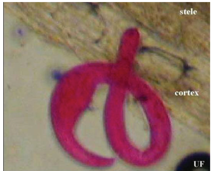
Figure 1. Young female of reniform nematode, Rotylenchulus reniformis Linford & Oliveira, with swollen body. The female penetrates the root of cowpea and the anterior portion (head region) of the body remains embedded in the root whereas the posterior portion (tail region) protrudes from the root surface.

There are ten species in the genus Rotylenchulus . Rotylenchulus reniformis is the most economically important species (Robinson 1997) and is called the reniform nematode.