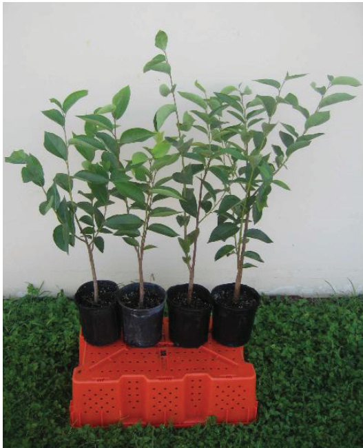
Figure 1. Pond apple seedlings.

surfaces. The differing leaf morphology and the underlying physiological differences may be the mechanisms to make pond apple significantly more tolerant to salt stress than bald cypress (Figures 2 and 3).