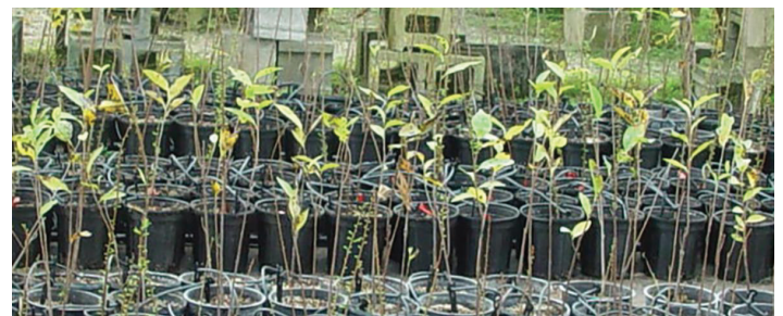
Figure 4. Pond apple seedlings suffering from iron deficiency.