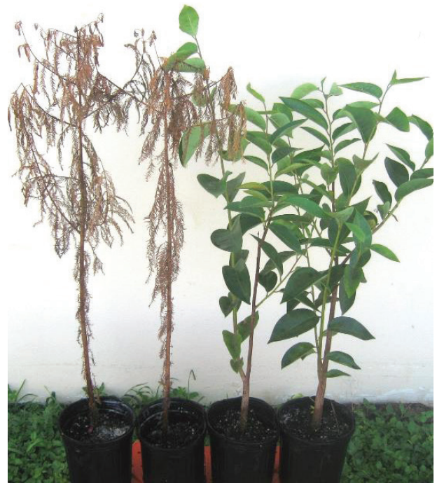
Figure 3. Bald cypress seedlings (left two plants) died of salt stress after roots were 100% submerged in brackish water with 15,000 ppm sodium chloride for 9 days, while pond apple seedlings (right two plants) grow well in the same growth condition.

publications on iron: Iron Deficiency in Palms ( https://edis.ifas.ufl.edu/ep265 ), Iron (Fe) Nutrition in Plants ( https://edis.ifas.ufl.edu/ss555 ), Understanding and Applying Chelated Fertilizers Effectively Based on Soil pH ( https://edis.ifas.ufl.edu/hs1208 ) (Broschat 2011; Hochmuth 2014; Liu et al. 2015).