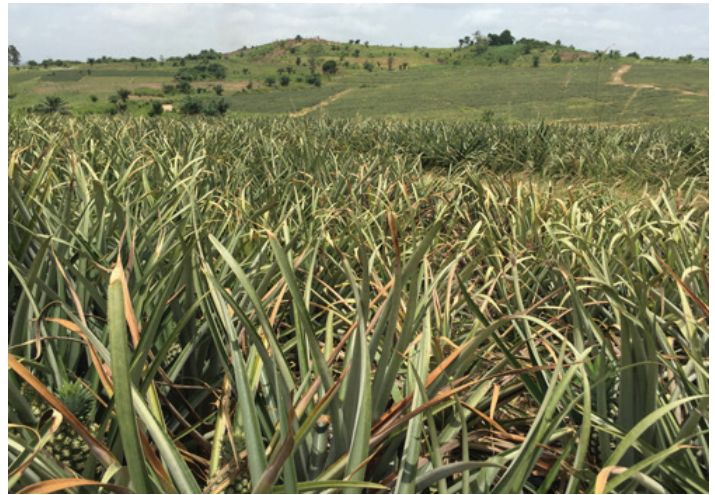
Figure 6. A pineapple field in Ghana with several plants showing symptoms of Pineapple mealybug wilt-associated virus .

It is recommended that crops infested with pineapple mealybug or Pineapple mealybug wilt-associated virus (Figure 6) be removed entirely from the field and burned. This includes all crop residue, followed by a field tilling. Mealybugs and ants can reside on many plants other than their preferred hosts, and weeds and other debris in and around the field will keep a population stable unless routinely cleared (Mau and Kessing 2007).