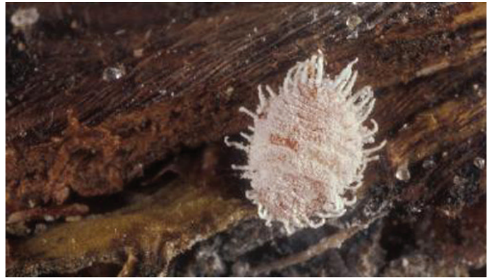
Figure 1. An adult pineapple mealybug, Dysmicoccus brevipes .

The pineapple mealybug is reported worldwide (Figure 2) and located anywhere pineapple is grown, including many African countries and Australia (CABI 2014; Beardsley 1993). It is believed to have originated in tropical areas in Central and South America (González-Hernández et al. 1999), and today has the highest density in areas considered tropic or subtropic. In the United States, it has been found in Florida, California, Louisiana, and all of the Hawaiian Islands.