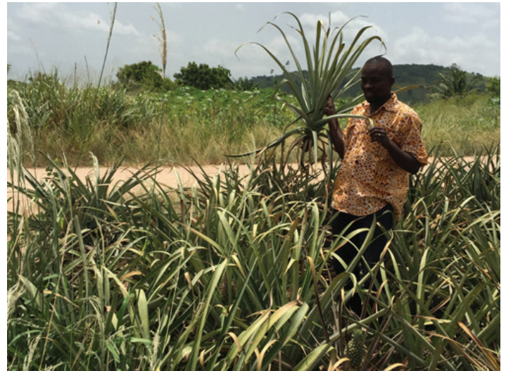
Figure 5. A farmer in Ghana holds up a pineapple plant infected with Pineapple mealybug wilt-associated virus .

The pineapple mealybug damages pineapple in several ways, all of which lower the market value of the fruit. Direct feeding damages the fruit, causing chlorotic areas (areas that cannot produce enough chlorophyll), rotted bottoms, and mealybug stripe (streaks of discoloration with underlying tissue collapse). Feeding by the pineapple mealybug can weaken the plant, increasing susceptibility to other pests and diseases. Black spot, caused by a fungus, is reported on pineapple fed upon by mealybugs. Black sooty mold and other molds commonly grow in areas exposed to a buildup of honeydew produced by mealybugs. The highest concern for pineapple growers is the pineapple mealybug often vectors Pineapple mealybug wilt-associated virus commonly referred to as pineapple wilt, mealybug wilt, or edge-wilt (Sether et al. 1998) (Figure 5).