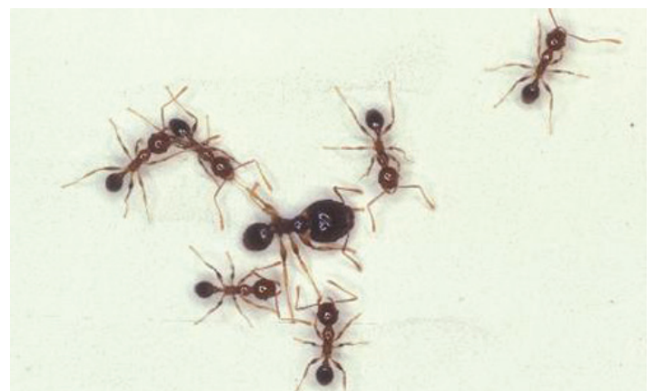
Figure 4. A major Pheidole megacephala worker (center) and several minor workers.

Like many scale insects, the pineapple mealybug is often tended to by ants, which harvest their honeydew as food. In return, the ants herd and protect the insects, even occasionally carrying the pineapple mealybugs to new host plants (Jahn and Beardsley 2000). The primary symbiotic ant species associated with the pineapple mealybug is Pheidole megacephala , commonly known as the bigheaded ant (Petty and Tustin 1993) (Figure 4). In Hawaii, these species are dependent upon each other. Other ant species associated with the pineapple mealybug include Iridomyrmex humilis , Solenopsis geminata , Ochetellus glaber , and others depending on the environment and geography (Rohrbach et al. 1988).