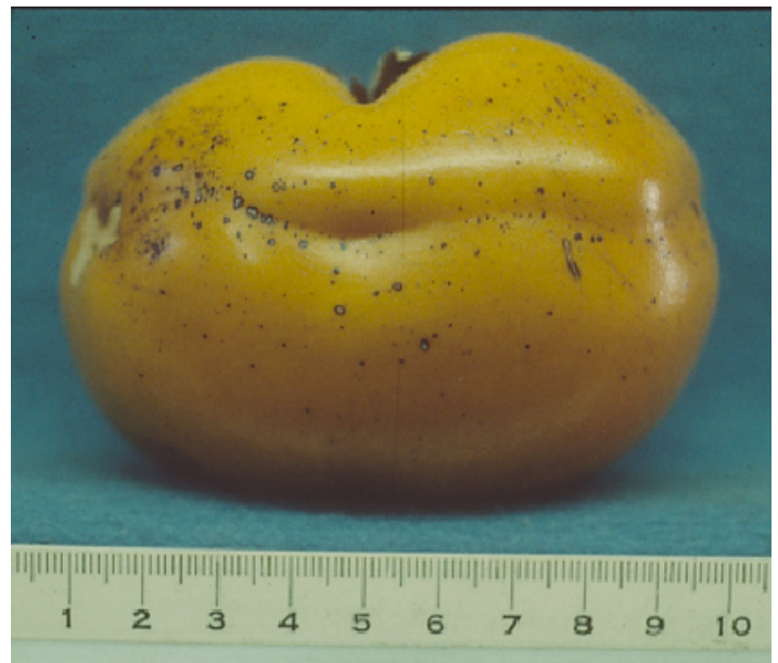
Figure 27. ‘Tamopan’ cultivar.

‘Tamopan’ is a cultivar with large fruit having a circular depression around the top third nearest the stem (Figure 27). The fruit is juicy, watery, and stringy, with a thick peel. More than one cultivar of this tree exists, some of which have better fruit than the one described.