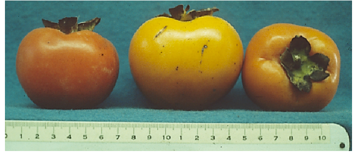
Figure 20. 'Eureka' cultivar.

' Eureka ' has been widely propagated by southern nurseries and is a common cultivar in Texas (Figure 20). It has a large, round, flat-shaped, pollination-variant fruit with a medium amount of dark flesh around the seed.