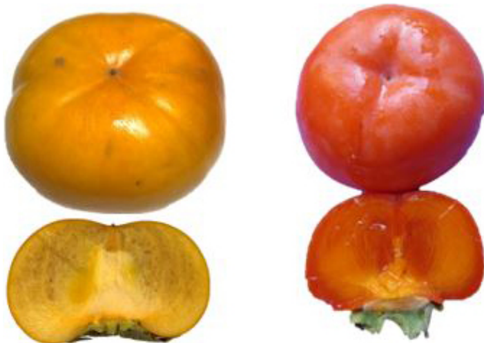
Figure 1. Nonastringent persimmon ‘Fuyu’ (left) and astringent ‘Hiratanenashi’ (right) ready-to-eat cultivars.

The second classification relates to fruit flesh color when seeds are present. In pollination-variant types, the flesh is dark and streaked around the seeds, but clear orange when seedless. Pollination-constant types lack the dark streaking regardless of seed set.