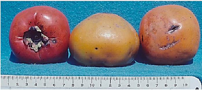
Figure 14. 'Shogatsu' cultivar.