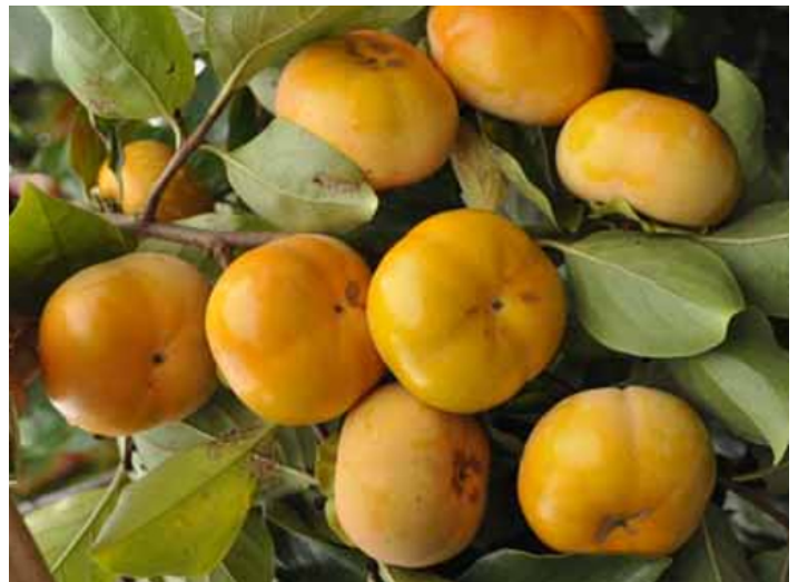
Figure 8. 'Ichikikei Jiro' cultivar.

'Ichikikei Jiro' is a bud sport of Jiro and is low to moderate in vigor (Figure 8). It blooms later than most persimmon cultivars. Fruit size is medium-large with soluble solids of 16% to 19%. Some fruit sustain tip cracking. Fruit are oblate. Harvest season is mid-October to mid-November. 'Ichikikei Jiro' is recommended for north and north central Florida.