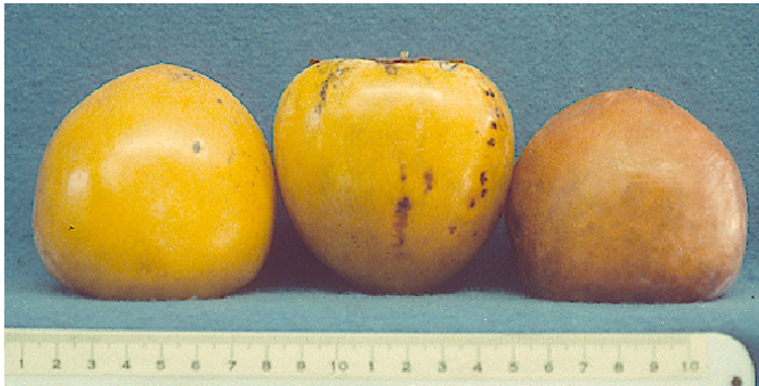
Figure 23. ‘Tanenashi’ cultivar.

‘Tanenashi’ , the most popular astringent cultivar in Florida, matures heavy crops without pollination and will seldom set seed even if pollinated (Figure 23). It is usually desirable to thin the fruit to obtain some vegetative growth during the year. The fruit, often large (3½” across), can weigh over ¾ of a pound. Skin color is deep yellow to orange when mature. The flesh is orange, pasty, comparatively dry, and of acceptable quality. Soluble solids average 16%. Harvest duration may extend from September through November. It is a good tree for homeowners.