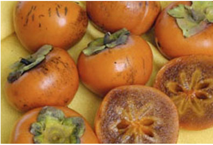
Figure 17. 'Nishumura Wase' cultivar