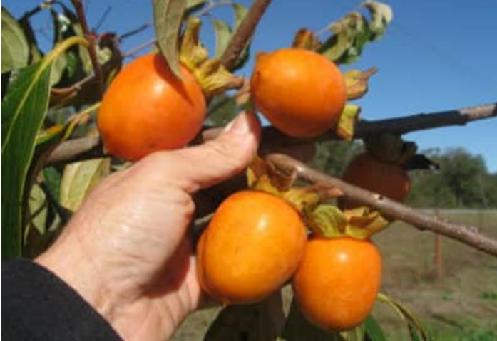
Figure 28. 'Ormond' cultivar.

'Ormond' is sometimes called the Christmas persimmon. Fruit are long, conic, and often harvested in January (Figure 28). The tree begins growing early in the spring, which increases chances for freeze injury. The fruit is juicy, with large seeds.