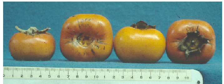
Figure 26. ‘Great Wall’ cultivar.

‘Great Wall’ is a strong-growing, small, 4-sided fruit (Figure 26). The flesh is dry, similar to ‘Tanenashi’, but of excellent quality. It grows on an upright tree.