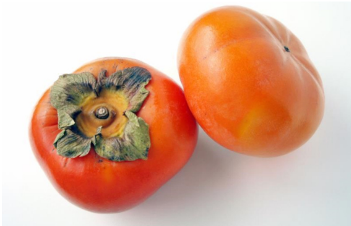
Figure 9. 'Jiro' cultivar.

'Jiro' is moderate in tree vigor. Cropping can be erratic when trees are young, but more consistent yield is produced on older trees (Figure 9). Fruit size is medium-large, soluble solids are 16%–19%, and fruit shape is oblate. Some tip cracking on fruit may occur. Harvest season is mid-October through mid-November. 'Jiro' is recommended.