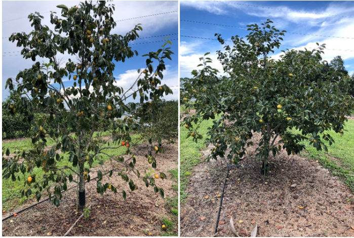
Figure 5. Tree size and shape can be varied among cultivars 'Saijo' (left) and 'Fuyu' (right).

trees fall into this category. Trees in the tall class are upright and often have small fruit. Generally, tree size is reduced south of Gainesville to south Florida. It has been observed that trees grown in Florida are often smaller than would be expected in their native land; common cultivars barely reached 10 ft in height after 10 years in trials during the 1960s.