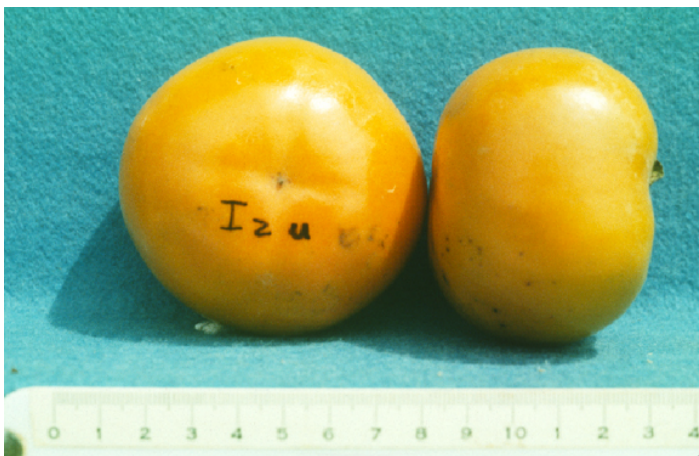
Figure 6. 'Izu' cultivar.

'Izu' has the distinction of being the earliest ripening nonstringent cultivar (Figure 6). Tree vigor is very low, and it is not precocious. Fruit size is medium-large, and soluble solids average 16%. Fruit shape is oblate, and a fair percentage of fruit show imperfections. Harvest season is late September through mid-November. 'Izu' is sometimes recommended due to early ripening.