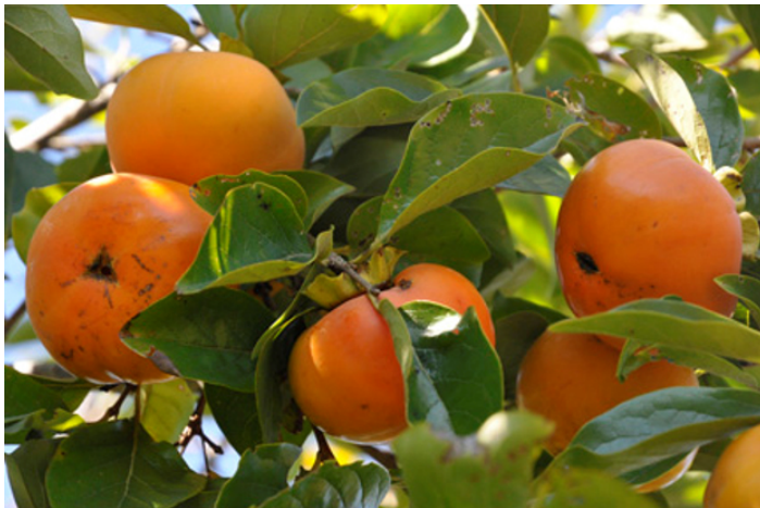
Figure 10. 'Maekawa Jiro' cultivar.

'Maekawa Jiro' , a bud sport of Jiro, is low to moderate in vigor (Figure 10). Fruit size is large, and fruit shape is oblate. There is some tendency for fruit to incur tip cracking. Harvest season is mid-October to mid-November. 'Maekawa Jiro' is not recommended for north and north central Florida.