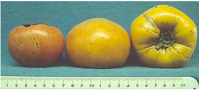
Figure 13. 'Hanagosho' cultivar.