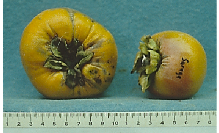
Figure 16. 'Suruga' cultivar.

'Suruga' trees are moderate in vigor (Figure 16). They produce late-ripening fruit that are exceptionally sweet (soluble solids = 18%–21%). Their fruit shape is classified as oblate conic, and fruit imperfections are fairly common. Fruit size is medium large. Harvest season is late November to early December. It appears to be susceptible to premature defoliation. 'Suruga' is not recommended for commercial cultivation.