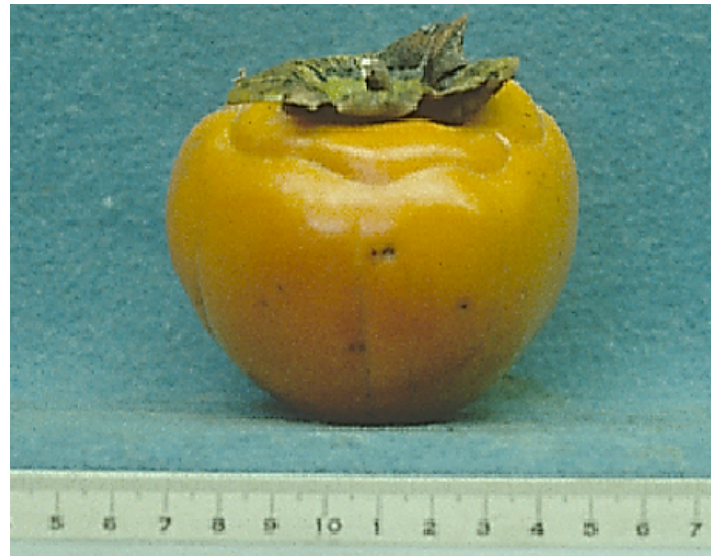
Figure 11. 'Midia' cultivar.

'Midia' trees are moderate in vigor but are more susceptible to tree decline than most other Japanese persimmons (Figure 11). Fruit set and fruit retention until harvest are not consistently high. 'Midia' produces the largest fruit of any cultivar of nonastringent persimmon. Fruit shape is round with an indented ring around the top of the fruit. Harvest season is late October to mid-November. 'Midia' is not recommended for north and north central Florida.