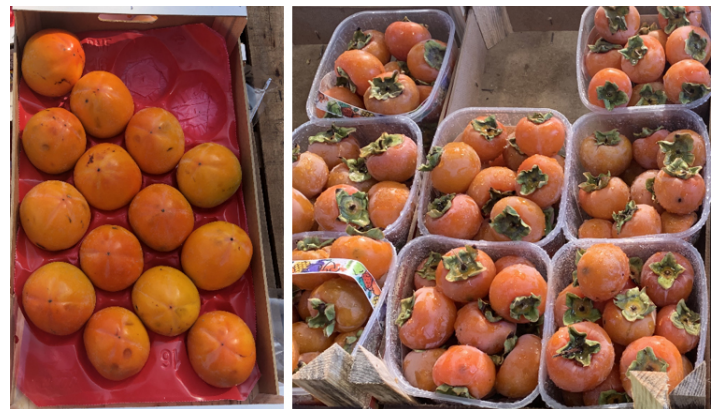
Figure 4. Fruit size among persimmon cultivars can be varied from 3.5 oz (100 g) to 14 oz (400 g).

Fruit size is affected by crop loads. The lighter the crop set, the larger the fruit. Small fruit generally weigh 3.5 oz (100 g) to 4.5 oz (130 g), medium fruit range from 5.5 oz (150 g) to 7.0 oz (200 g), and large fruit range from 8 oz (230 g) to 14 oz (400 g) (Figure 4).