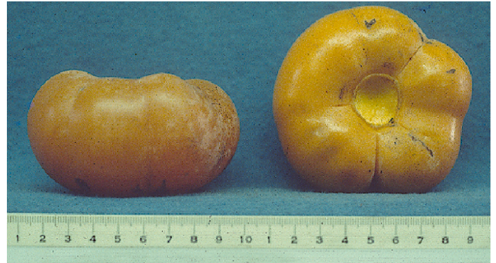
Figure 21. 'Sheng' cultivar.

' Sheng ' is a well-spreading tree with large fruit having lobed sections looking somewhat like a 4- or 6-leaf clover from the top (Figure 21). Fruit have a high jelly content, are bright orange, and when pollinated will set many seed.