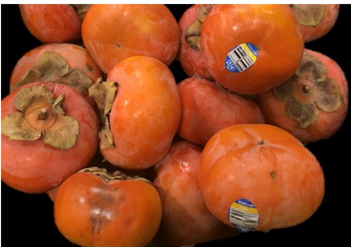
Figure 15. 'Fuyu' cultivar.

'Fuyu', also known as 'Fuyugaki', is the most popular nonastringent tree in Florida and is the most widely grown persimmon cultivar in the world. It is weakly 4-sided and firm when ripe, with very few seeds (Figure 15). Fruit thinning is usually necessary to ensure large fruit, prevent clustering, and regulate crop loads. Incidence of fruit imperfections is low, yields are good, and the tree is generally well adapted, with a soluble solids average of 18%. Many different cultivars with the name 'Fuyu' or 'Fuyugaki' exist. Fruit shape is oblate and few fruit show imperfections. Harvest season is mid-November through early December. 'Fuyu' is highly recommended for north and north central Florida.