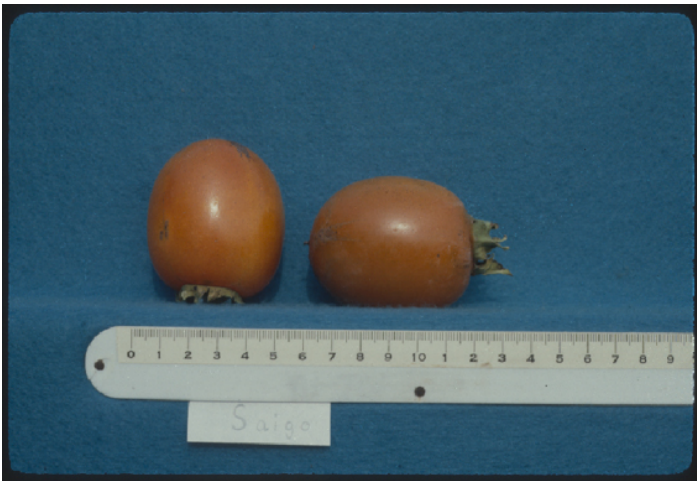
Figure 18. 'Saijo' cultivar.

' Giombo ' is similar to 'Saijo' in fruit quality, although the fruit are much larger and begin ripening 2 weeks later (Figure 19). Fruit are light translucent orange and thin-peeled with a sweet, juicy, jelly-type flesh. 'Giombo' fruit are a connoisseur's choice. The tree is early to start growth in the spring and is sometimes injured by freezing temperatures.