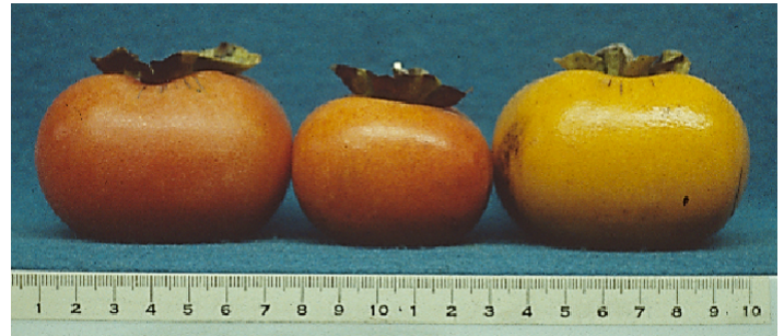
Figure 25. ‘Hiratanenashi’ cultivar

always seedless. The astringency is sometimes difficult to remove after the fruit have been harvested unless they are artificially treated.