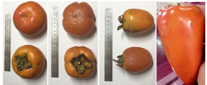
Figure 3. Different fruit shapes among persimmon cultivars.

The three general fruit shapes are conic (cone-shaped), roundish (round and sometimes pointed at the apex like an acorn), and oblate (flattened like a large standard tomato) (Figure 3). Some cultivars have other noticeable characteristics, such as an indented ring around the fruit of ‘Midia’ and ‘Tamopan’. Four sides will sometimes be apparent on fruit of ‘Great Wall’ or ‘Saijo’. Distinctly lobed sections are present on ‘Sheng’ and ‘Peiping’. Some cultivars are tucked or folded in at the calyx, like ‘Suruga’.