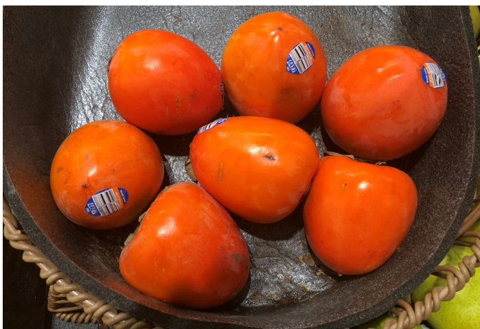
Figure 24. ‘Hachiya’ cultivar.

‘Hachiya’ is a commercial cultivar in California (Figure 24). Ability to set and hold fruit is sometimes a problem if this cultivar is propagated onto Diospyros virginiana rootstock. The fruit are high quality and jelly-fleshed, with an attractive red skin coloration. Fruit will often have concentric ring cracking at the apical end and will ripen unevenly starting from these points. In Japan, ‘Hachiya’ is mostly used for drying. It remains astringent until fully ripened and soft.