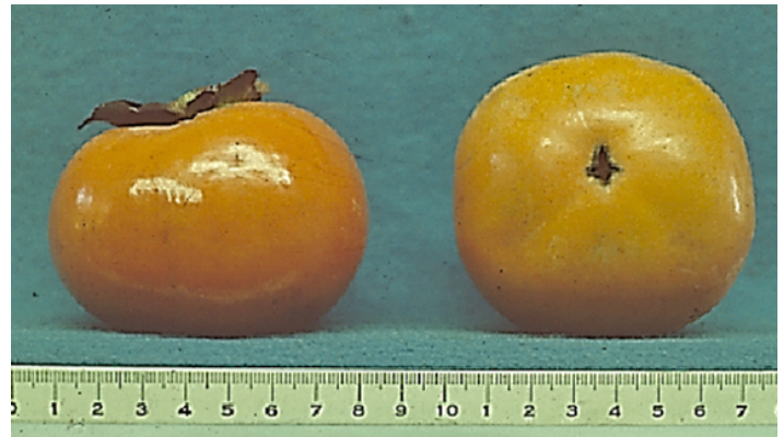
Figure 12. 'Hana Fuyu' cultivar.

'Hana Fuyu' , also known as 'Yotsundani' or 'Giant Fuyu', regulates crop loads well and is of medium vigor (Figure 12). The fruit are slightly larger than most, are generally free of imperfections, and may be slow to lose astringency. The tree is a good homeowner cultivar.