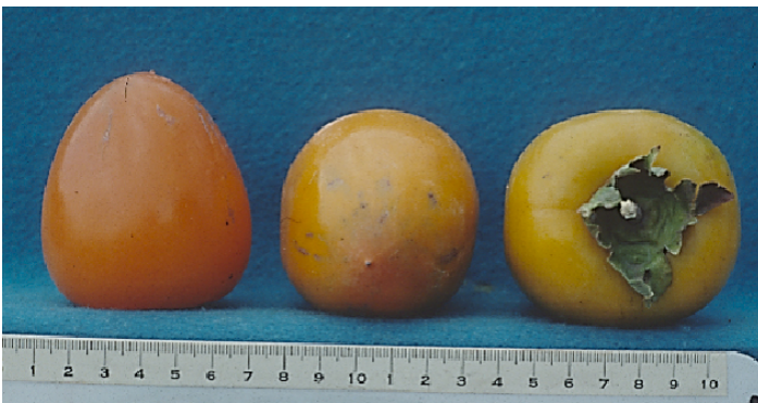
Figure 19. 'Giombo' cultivar. Credits: UF/IFAS Horticultural Sciences Department

' Giombo ' is similar to 'Saijo' in fruit quality, although the fruit are much larger and begin ripening 2 weeks later (Figure 19). Fruit are light translucent orange and thin-peeled with a sweet, juicy, jelly-type flesh. 'Giombo' fruit are a connoisseur's choice. The tree is early to start growth in the spring and is sometimes injured by freezing temperatures.