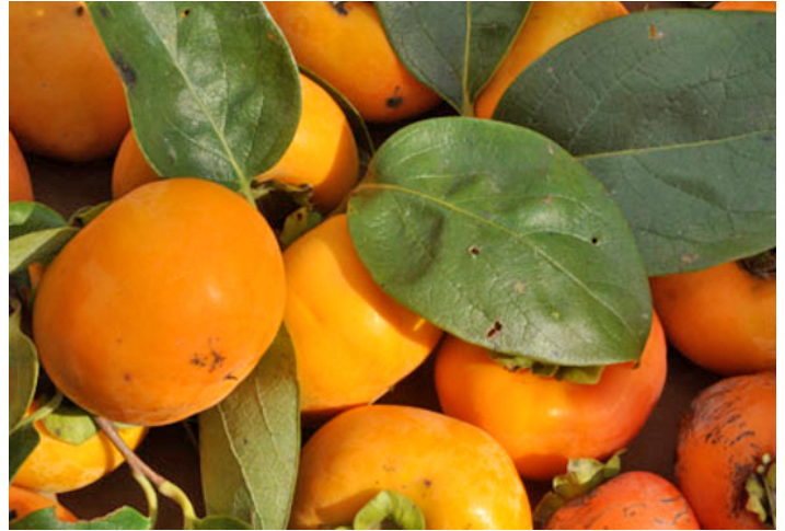
Figure 7. 'Matsumoto Wase Fuyu' cultivar.

'Matsumoto Wase Fuyu' is an earlier-ripening bud sport of 'Fuyu' (Figure 7). The tree sets many flowers and produces heavy, clustered crops. The clusters should be thinned to prevent bent limbs with excessive fruit loads. Larger fruit are sometimes prone to calyx separation. The tree is moderately vigorous and of medium size. Soluble solids range from 16% to 19%, which is generally true for most mid-season types. Fruit is medium in size and oblate in shape. There is little or no tendency for fruit to incur tip cracking.