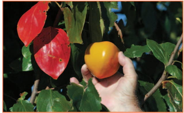
Figure 10. 'Fankio' persimmon.