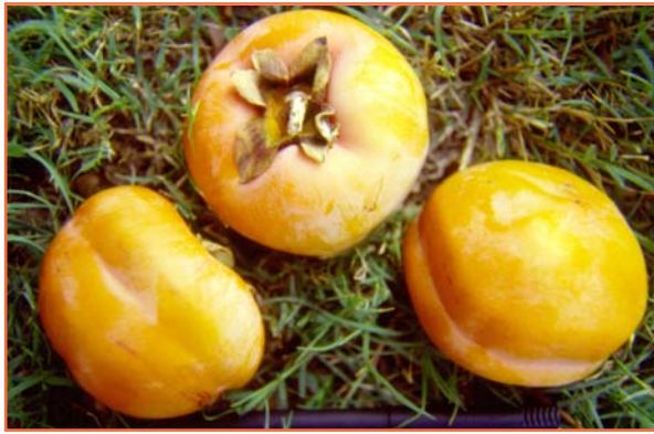
Figure 7. 'Tamopan' persimmon.