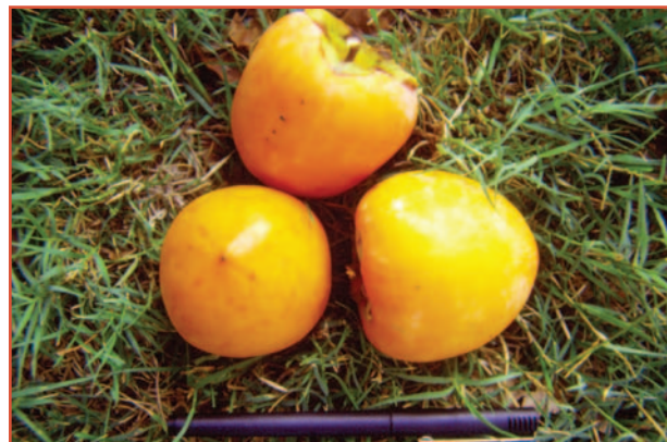
Figure 6. 'Tane-nashi' persimmon.