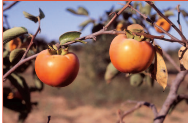
Figure 4. 'Eureka' persimmon.