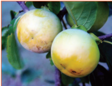
Figure 8. 'Fuyu' persimmon.