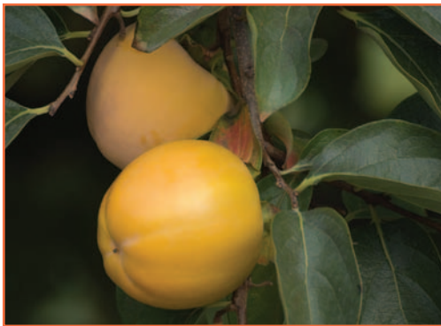
Figure 9. 'Izu' persimmon.