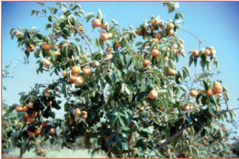
Figure 2. One of the Oriental persimmons; note the fruit load and dark green foliage.

The common American persimmon makes excellent rootstock and is graft compatible for cultivated Oriental persimmons in the southern United States and Texas.