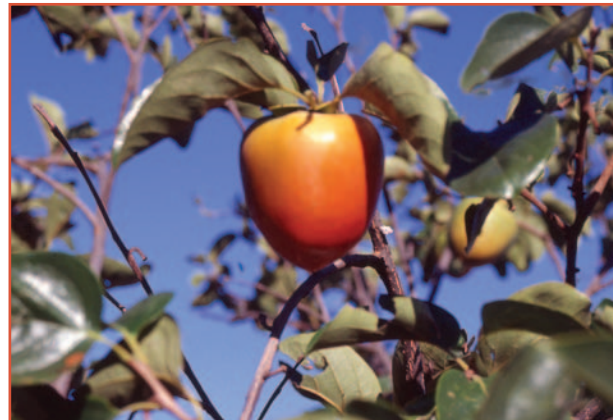
Figure 5. 'Hachiya' persimmon.