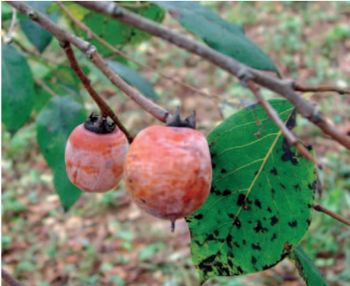
Figure 3. Several fungi cause leaf spot on Persimmons and can also affect the fruit; but only severe cases require treatment.

Persimmons are largely free of serious diseases; however, crown gall and anthracnose have occasionally caused problems. Trees infected with crown gall ( Agrobacterium tumefaciens ) develop tumors or galls on their branches and roots, which eventually become hard and rough.