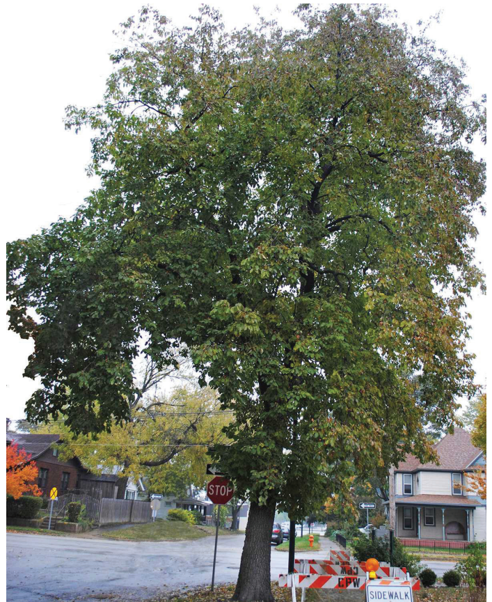
Figure 1. Full Form— Diospyros virginiana : common persimmon

Uses: fruit; reclamation; specimen; urban tolerant; highway median; bonsai