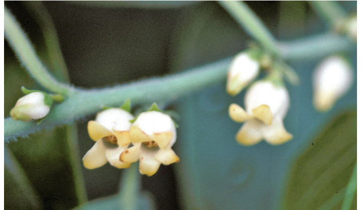
Figure 4. Flower— Diospyros virginiana : common persimmon