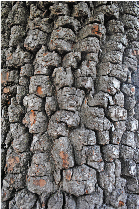
Figure 6. Bark— Diospyros virginiana : common persimmon