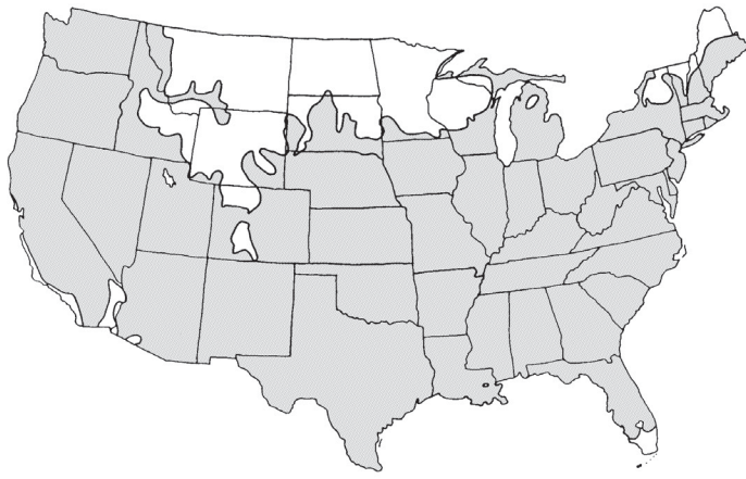
Figure 2. Range