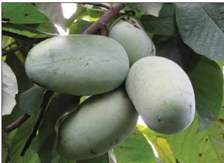
"KSU-Atwood™"