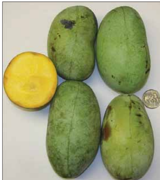
"KSU-Atwood™"

Cultivars: KSU-Atwood™, Davis, Mango, Mitchell, NC-1, Overleese, PA Golden, Prolific, Sunflower, Sweet Alice, Taylor, Taytwo, Wells, Wilson, seedlings