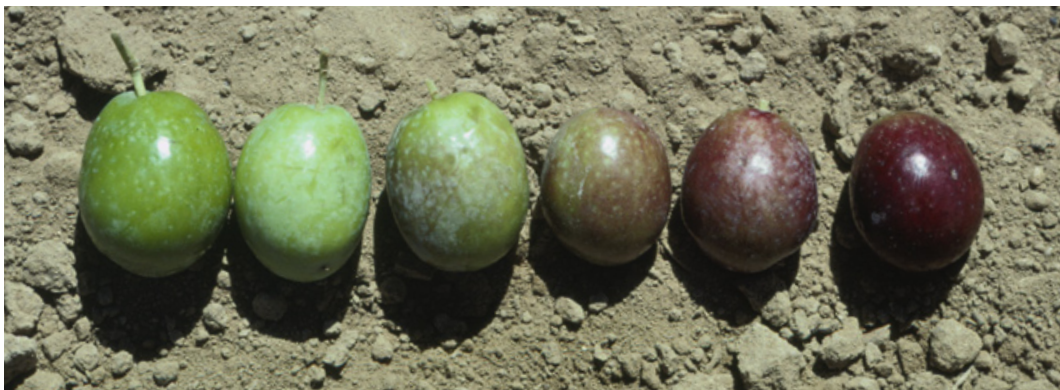
Figure 1. Freshly harvested olives at different stages of ripeness: green-ripe (1 and 2); yellow-green to straw (3); rose to red-brown (4 and 5); and red-brown (6) (may be too soft for some types of olive curing). Not shown are naturally black ripe olives (also described as dark red to purplish black).

Naturally black ripe olives are harvested in California starting in mid-November and continuing through December, depending on the variety, crop yield, and region, and on weather conditions. When mature, these olives will release a reddish black liquid when you squeeze them and their flesh will be nearly completely pigmented. Ripe olives bruise easily and must be handled with care.