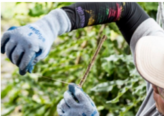
Figure 11. Wrapping the graft with a rubber band strip while retaining pressure on the graft union and while connecting scion and rootstock cambiums.