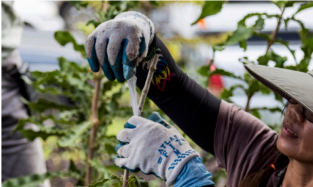
Figure 12a. Beginning to wrap the scion with parafilm from the graft union and upward.