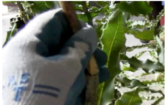
Figure 7. Matching the diameter of the scion with the rootstock.