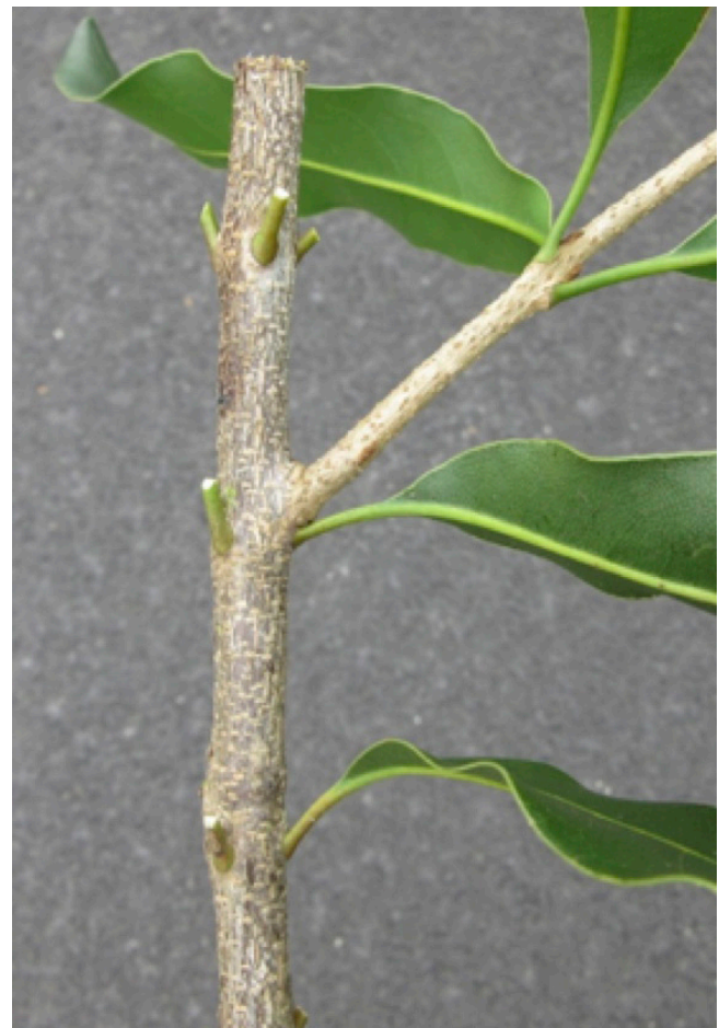
Figure 5. Example of a scion wood piece that could be used for grafting. Note the direction of the buds, which are facing upwards.