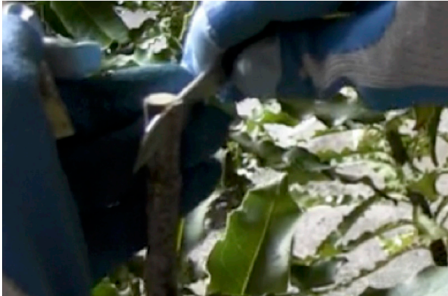
Figure 9. Completing the cut into the rootstock.