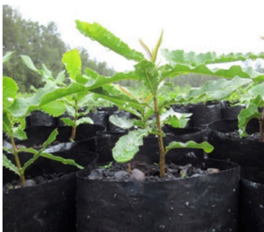
Figure 1. Seedlings after being thinned to one per pot, approximately three months after planting.

M acadamia nut ( Macadamia integrifolia ) is one of the most important tree crops in the state of Hawai'i. Macadamia does not grow true to seed, and therefore clonal propagation is required in order to maintain the quality and productivity of our macadamia trees. To do this, we must use recognized varieties and clone them by grafting. Grafting macadamia can be difficult for a beginner because the wood is hard, and a successful graft takes skill. However, the process can be broken down into three stages: 1) preparing and growing the rootstock, 1 2) preparing the scion wood, 2 and 3) successfully fusing the scion and rootstock together. With careful planning and execution, your grafted tree could be ready to transplant in two years!