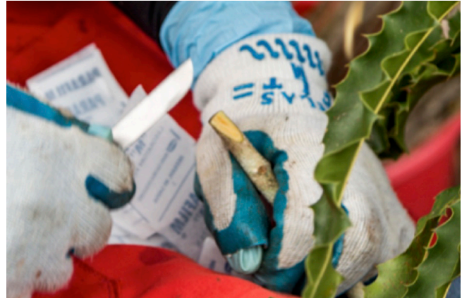
Figure 6. Making the cut into the scion wood.