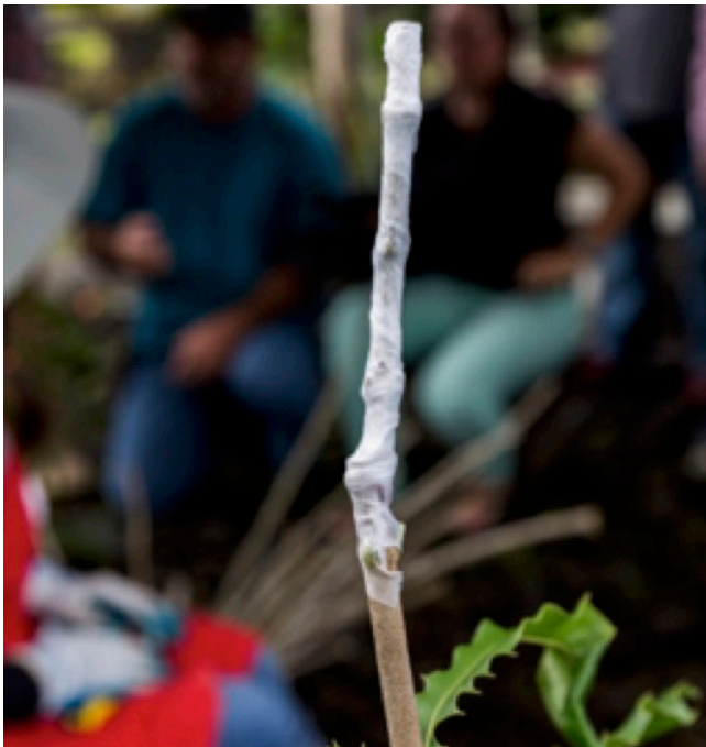
Figure 12c. A completed graft with parafilm covering the union and entire scion.