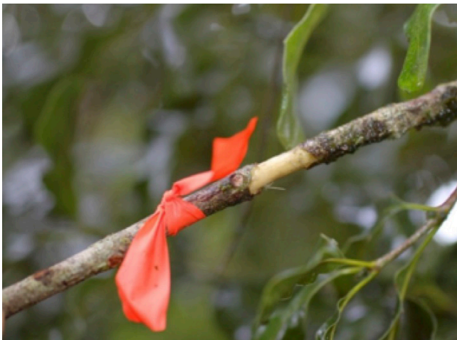
Figure 4. Completed girdling of macadamia tree branch for scion wood; branch flagged with the date for future harvesting of scion wood.

the scion wood cool and in a humid environment to prevent it from drying out. Avoid waterlogging the scion, and maintain awareness of the scion's polarity (top and bottom) (Fig. 5).