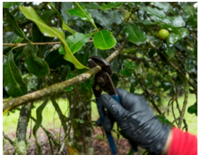
Figure 3. Girdling a branch selected for scion wood in the field.

Note: Girdling the branch prevents the movement of carbohydrates, which are formed in the leaves