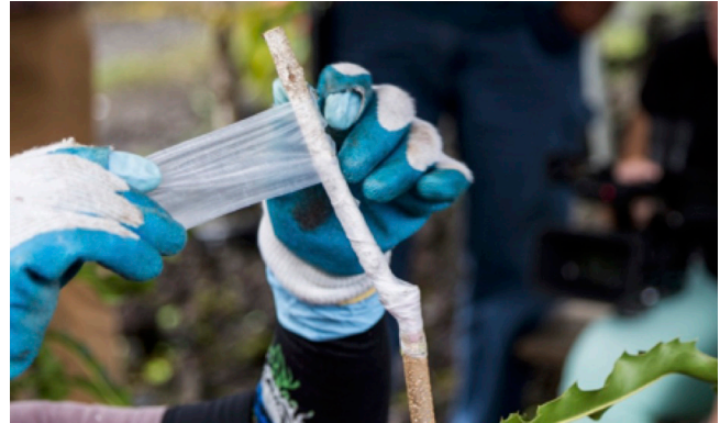
Figure 12b. Complete coverage of the scion wood is important to reduce water loss and potential entry of pathogens into the graft.