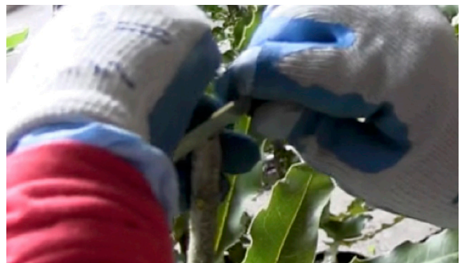
Figure 8. Inserting the grafting knife into the rootstock.