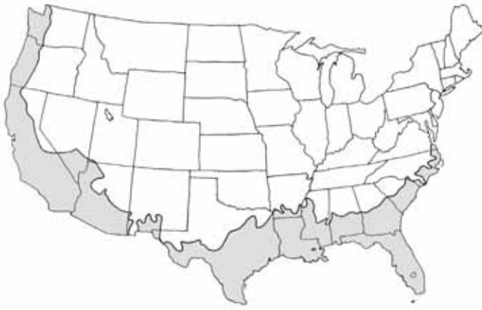
Figure 2. Range