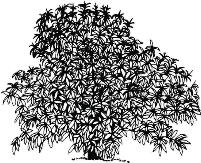
Figure 1. Middle-aged Eriobotrya japonica 'Coppertone': 'Coppertone' Loquat.

The dense, rounded, copper-colored canopy of Loquat is decorated in USDA hardiness zones 8b through 11 in late winter and spring with clusters of apricot yellow, pear-shaped, edible furry fruits. Fruit rarely sets further north. Loquat is a rapidly-growing evergreen tree and can reach 25 to 30 feet in height in the shade but is frequently seen 15 feet tall with a 15 to 25 foot spread in a sunny location. The 10 to 12-inch-long leaves are rusty-colored beneath and have a coarse texture. Fragrant clusters of pale pink flowers are produced in fall, followed by the delicious, brightly colored, winter fruit.