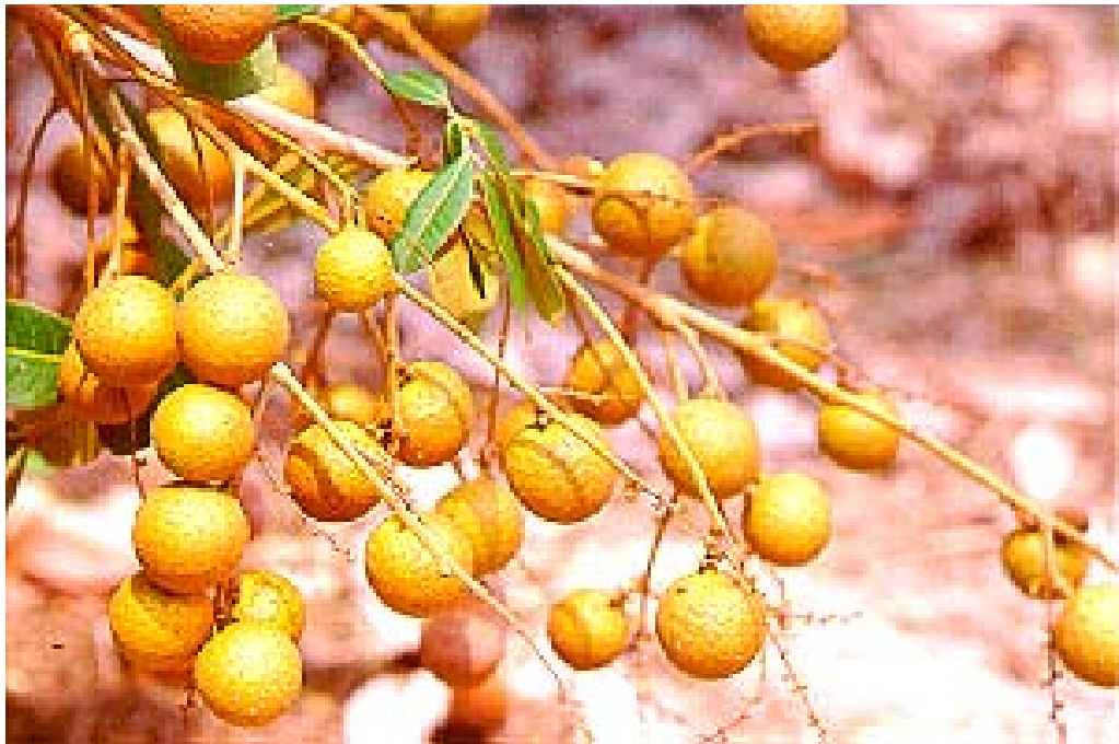
Figure 1. The commercial longan ( Dimocarpus longan ssp. longan var. longan ).