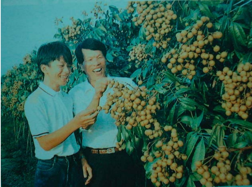
Figure 6. High density planting of ‘Shixia’ longan in China (from: Anon., 1992).