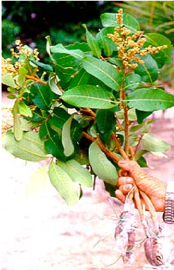
Figure 5. Marcots which have been removed from a parent tree.