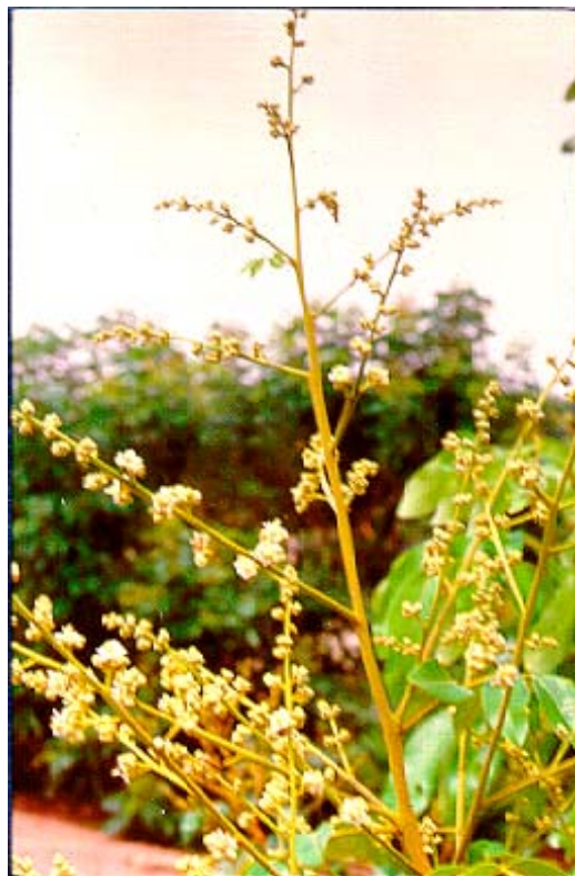
Figure 4. Terminal, greatly branched and leafless inflorescence of longan.