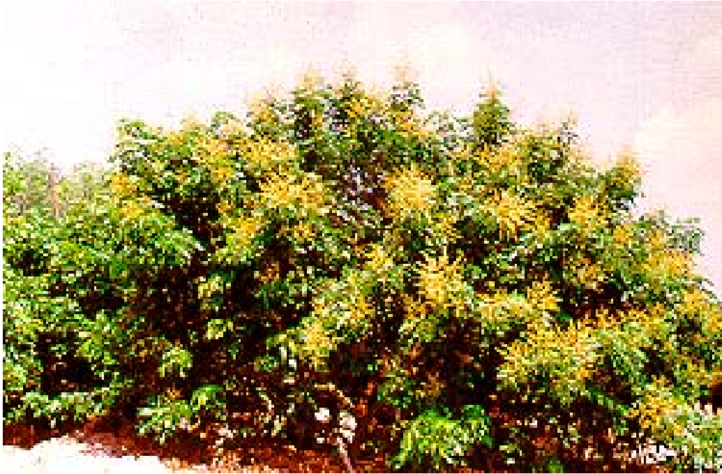
Figure 3. Longan tree with terminal inflorescences.