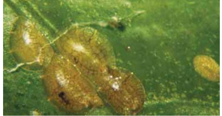
Figure 11. Soft brown scale.

The scale is heavily parasitized by several different species of parasitic wasps.