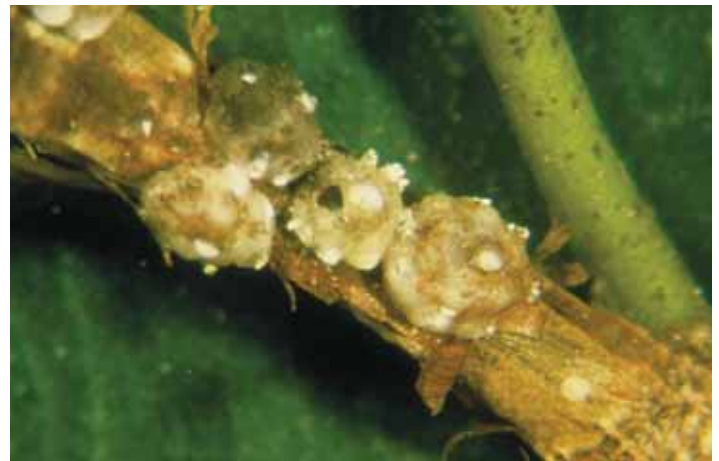
Figure 12. Florida wax scale.

The adult female is covered with a thick layer of soft wax, about 2 to 4 mm in length and 1 to 3.5 mm in width. Males are unknown in this species. Florida wax scale is highly convex, somewhat angular, and oval. The color is white, sometimes with a pinkish cast, becoming dirty white with age (Fig 12). Eggs are pink to dark red and are found under the scale's wax covering. Crawlers are pink, migrate away from under the female's wax covering, settle, and begin to extract sap from leaves or twigs. Young scales have a similar wax covering. Large amounts of honeydew are secreted by this species. Immature stages of Florida wax scales are found on the leaves and twigs with older stages frequently found on twigs and branches. Leaf populations are aligned with the leaf midrib. Florida wax scales are seldom found in large numbers due to presence of effective natural enemies.