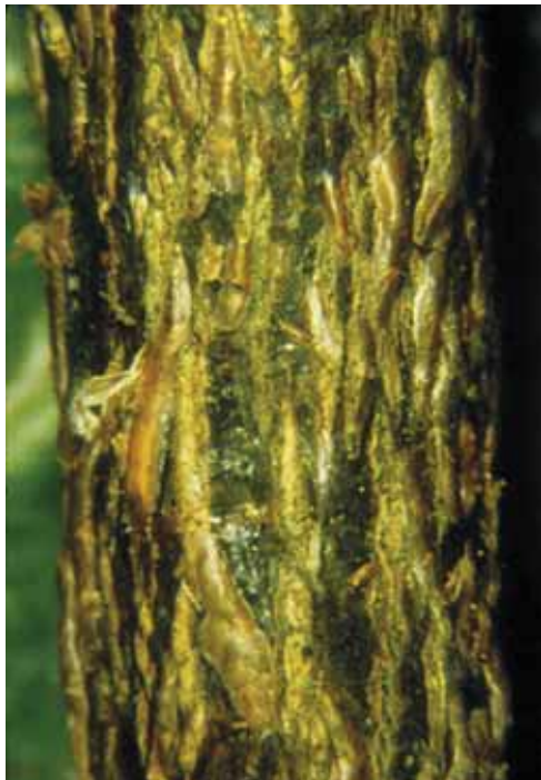
Figure 3. Glover scales on bark.