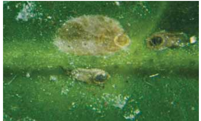
Figure 8. Chaff scale.

the shape of the area where it begins development and will develop successive layers resembling grain chaff. The color is brownish to grayish. The female body, eggs, and crawlers are purple in color. Immature and male scales resemble the female but are smaller in size. Chaff scale is found on bark, leaves, and fruit. When fruit is infested, the areas around the scale remains green at maturity. Chaff scale can also be found under the calyx of the fruit. When found on the leaves, the midrib is a favored site for settling. Chaff scales are difficult to remove from the fruit surface in normal packinghouse operations. Effective biological control is provided by the parasitic wasp, Aphytis hispanicus (Mercet).