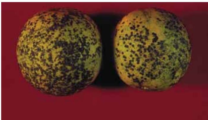
Figure 7. Florida red scale on fruit.

Florida red scale is under biological control by the introduced parasite, Aphytis holoxanthus (DeBach). Some additional insect predators feed on Florida red scale.