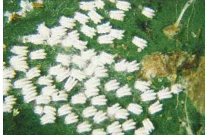
Figure 4. Fern scale.

but not on large limbs or trunks. This scale has a wide host range and is found throughout Florida, but never causes economic damage to citrus.