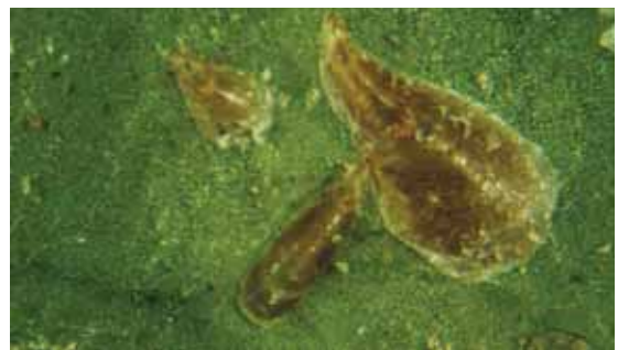
Figure 1. Purple scale.

The armor of the adult female scale is 2 to 3 mm long, purple to dark brown, elongated, and usually curved (Fig. 1). The armor of the male is much shorter and more slender than the female. The eggs are found under the scale cover and after hatching, the pearl white crawlers are less than 0.25 mm in length. Infestations may occur at any time, but are usually highest during the spring. Purple scales prefer a tree with a dense canopy and are found on leaves, twigs, and fruit. In most cases chemical control is not required as biological control by a parasitic wasp, Aphytis lepidosaphes Compere and the ladybeetle, Chilocorus stigma Say, provide adequate control. Other predators and parasitic fungi have also been found attacking the purple scales in Florida.