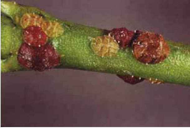
Figure 9. Caribbean black scale (various stages).

two months in cooler weather. Newly hatched nymphs are bright red with dark antennae. Total length of the scale, including the egg sac, is 10 to 15 mm.