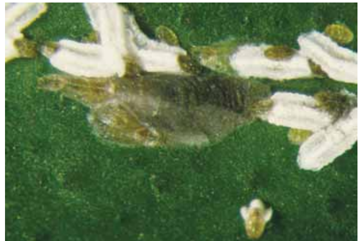
Figure 5. Snow scale, male and females.

The adult female is 1.5 to 2.25 mm long. The female armor is shaped like an oyster shell, with a central longitudinal ridge. It is brownish purple to black, with a grey border. Beneath the outer covering is an elongated orange-yellow membranous scale body. The immature male scale armor is white with parallel sides and three longitudinal sections, one central with two marginal ridges (Fig. 5). The adult male is winged and light yellow. The crawlers are oblong and light orange to reddish in color.