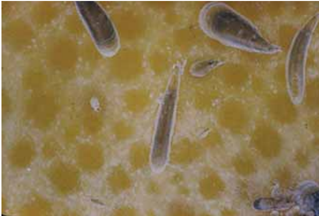
Figure 2. Glover scale, upper right corner contains a purple scale for comparison.

Glover scale is sometimes referred to as long scale. The scale covering is brown, elongated, narrow in width and about 3 mm in length (Fig. 2). The glover scale is similar to the purple scale and can be found in mixed populations. Glover scales infest leaves, twigs, woody bark, and fruit. When found on woody bark, they orient with the grain of the bark and parallel to one another and are frequently difficult to detect (Fig. 3). Glover scales are usually kept under biological control by Aphytis parasitic wasps.