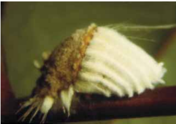
Figure 10. Cottonycushion scale.

Early immature stages of the scale cause the greatest damage on citrus while extracting plant sap during feeding along the leaf midrib and on green twigs. Later stages migrate to the larger twigs, where they feed and secrete honeydew from which sooty mold grows. Heavy infestations may result in defoliation, twig dieback, and fruit drop. Cottonycushion scale can be found on many species of ornamental plants as well as on citrus.