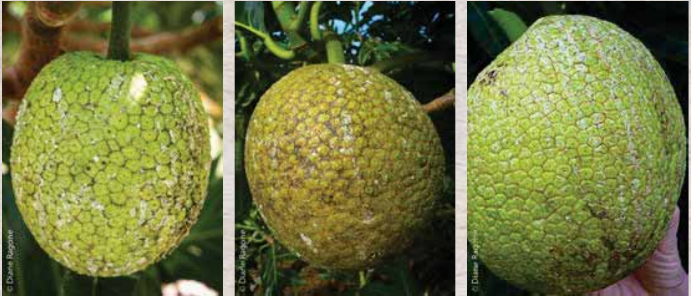
Mature fruit of three varieties. Left to right: Ma'afala, Hawaiian 'Ulu, and Meinpadahk.

The nutrient compositions of breadfruit (average of the Hawaiian 'Ulu, Ma'afala, and Meinpadahk), white rice, and white potato with the skin, are shown in Table 1. Just 100 g of breadfruit (approximately ½ cup) provides 25% of the RDA for fiber, and 5–10% of the RDA for protein, magnesium, potassium, phosphorus, thiamine (B 1 ), and niacin (B 3 ). Breadfruit also provides some carotenoids, such as β-carotene and lutein, which are not present in white rice or white potato.