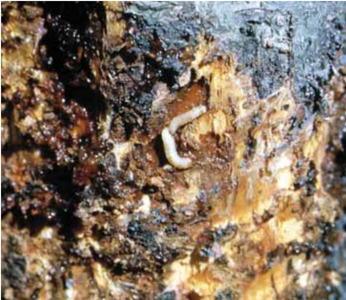
Figure 2. Damage and larval feeding on trunk of peach tree by peachtree borer larvae.