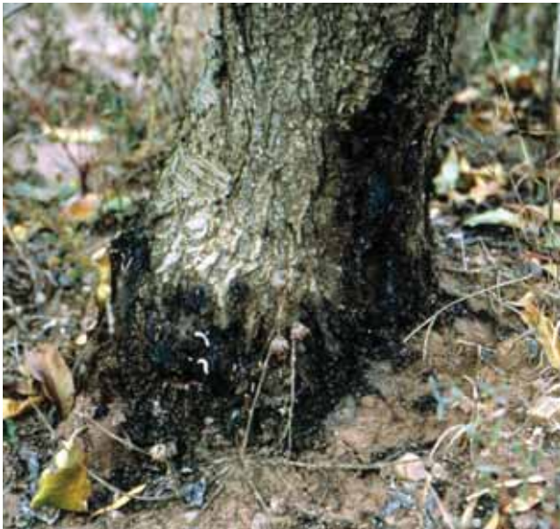
Figure 3. Gummosis at ground level of peach tree infested by the peachtree borer.