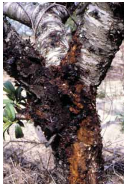
Figure 7. Damage—gummosis and sawdust—caused by feeding of lesser peachtree borer.