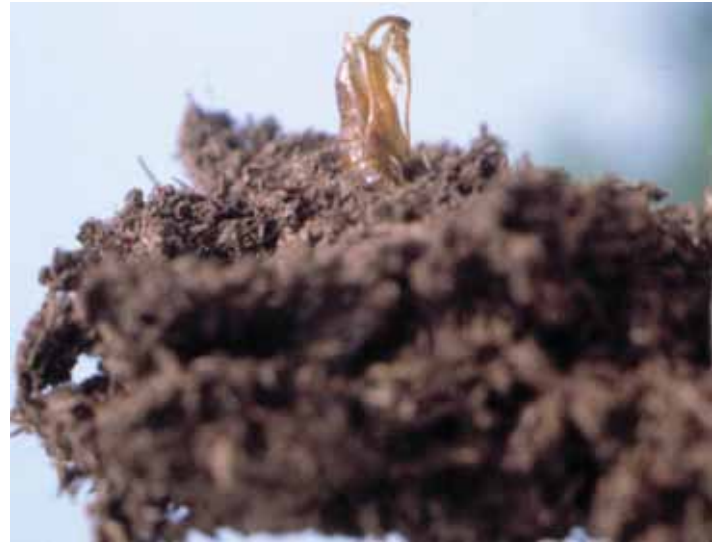
Figure 4. Peachtree borer pupal case protruded from the tree indicates borer emergence.