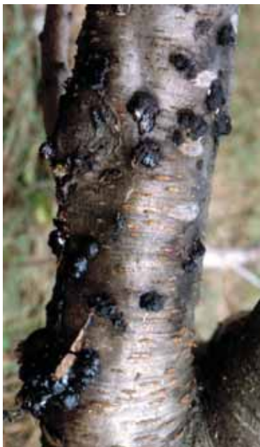
Figure 6. Gummosis caused by lesser peachtree borer on lower limbs.

Several chemicals are registered for use against borers (See Insect Management on Peaches , http://edis.ifas.ufl.edu/IG075 , for approved, registered compounds). These chemicals must be applied using a sprayer with a handgun so that the trunk and scaffold limbs are adequately covered.