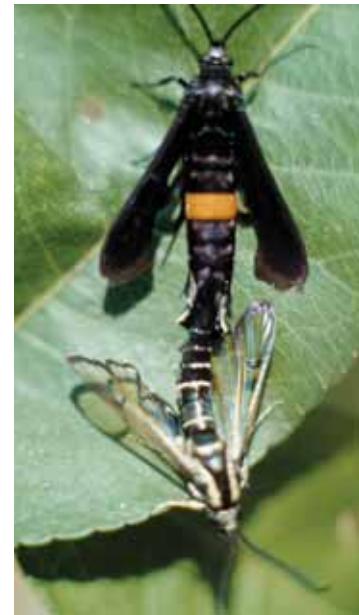
Figure 1. Adult female (top) and male (bottom) of the peachtree borer.

The larvae enter the tree through cracks or wounds in the bark and mine beneath the bark from 6 inches above the ground to the root crown. PTB larvae may be detected by