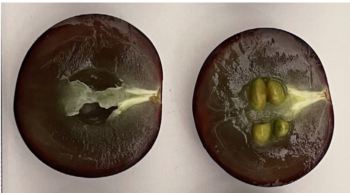
Figure 3. Anatomy of both halves of 'Supreme' muscadine fruit.