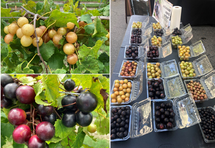
Figure 2. Muscadine grapes on vines (left) and varieties on display in clamshell containers (right).

muscadine peel is a rich source of antioxidants, dietary fiber, flavonoids, and other beneficial phytochemicals including high levels of resveratrol, a polyphenolic compound reported to have antioxidant and anti-inflammatory properties. The fruit's other beneficial compounds include anthocyanins and ellagic acid. Although the anatomy of muscadine grapes is like that of other grape types, its fruit are typically larger, with thicker peels and larger seeds.