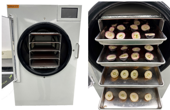
Figure 5. A small-scale freeze-dryer (left) and halved muscadines following drying (right).

Several steps are involved in the freeze-drying process for muscadine fruit (Figure 6):