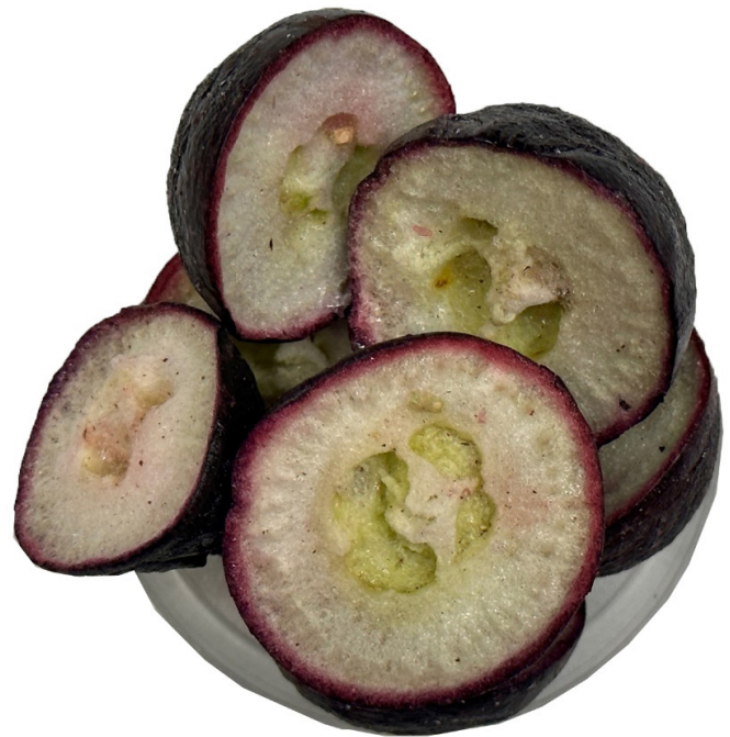
Figure 8. Freeze-dried 'Paulk' muscadine.