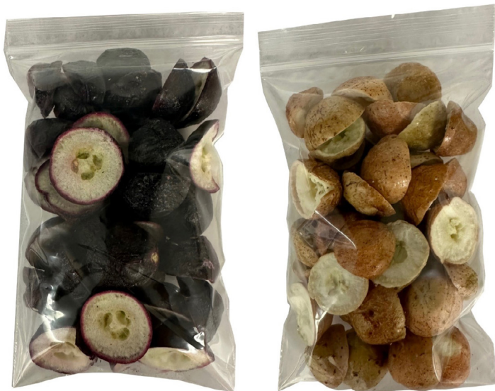
Figure 9. Freeze-dried muscadine fruit halves packed in sealed bags for storage. 'Paulk' (left) and 'GA-13-4-2' (right).