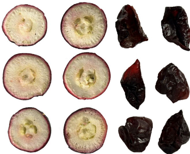
Figure 7. Differences in appearance between freeze-dried (left) and oven-dried (right) muscadine fruit halves.