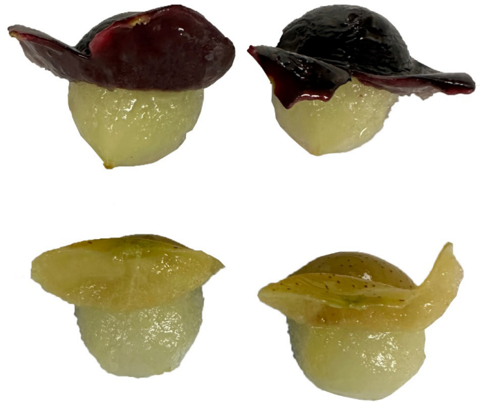
Figure 4. Semi-peeled muscadine grapes showing the thick peel: 'Paulk' (top); 'GA-13-4-2' (bottom).

Regardless of its nutritional benefits, the peel can be difficult to chew and swallow—a fact people often cited as the reason why they do not consume the peel, discarding it instead (Figure 4). The peel's thickness also makes it difficult to extract the juice; and muscadines are primarily used in juices. The seeds within the fruit are tough, difficult to chew, and very bitter, further discouraging peel consumption. Starting educational and promotional programs