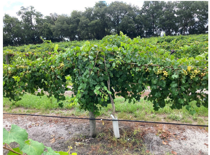
Figure 1. Muscadine vines at the time of harvest in late summer.

Muscadine grape ( Muscadinia rotundifolia [Michx.] is a fruit crop native to America; it was the first grape species cultivated in the country. Muscadine grapes (Figure 1) adapt well to a wide range of biotic and abiotic stresses and have thus been grown and vinified throughout the southeastern US for centuries. Currently, southeastern farmers grow approximately 5,000 acres of almost 100 improved muscadine-grape varieties for commercial use. Muscadine grapes are commonly consumed fresh or processed into juice, wine, or jam. Recent research demonstrated the fruit's significant contribution of beneficial phytochemicals to the typical American diet; and thereafter, the demand for muscadine grapes considerably increased. Many consumers now consider muscadine grapes a favorable, healthy food due to their unique blend of bioactive compounds and antioxidant properties. Its thick peels and seeds, though, have prevented wider public consumption. This publication aims to introduce growers, Extension agents/specialists, and the general public to the potential for a new, value-added product that makes muscadine grapes much easier to eat and may diversify the food processing industry.