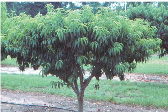
Figure 3. A peach tree expressing systems of phony peach disease.

Peach trees with symptoms of PPD were first noticed throughout the South about 1890. Infected peach and plum trees bloom several days earlier than healthy trees and tend to hold their leaves later into the fall. Early in July, because of shortened internodes (Figure 3), infected peach trees appear more compact, leafier, and darker green than normal trees. In addition to reductions in overall quality and yield, individual fruits are drastically reduced in size. Also, fruit may be more colorful and will often ripen a few days earlier than normal. The leaves of infected peach never display the typical scorched or scalded appearance that is diagnostically typical of leaves from infected plum trees (Figure 4). Trees that develop PPD symptoms before bearing age never become productive. PPD does not kill the tree but may make it more susceptible to other diseases and arthropods. Plum leaf scald also increases tree susceptibility to other problems but will kill infected trees. Leafhoppers feed extensively on plum cultivars such as Santa Rosa and Methley, cultivars that are highly susceptible to the bacterium.