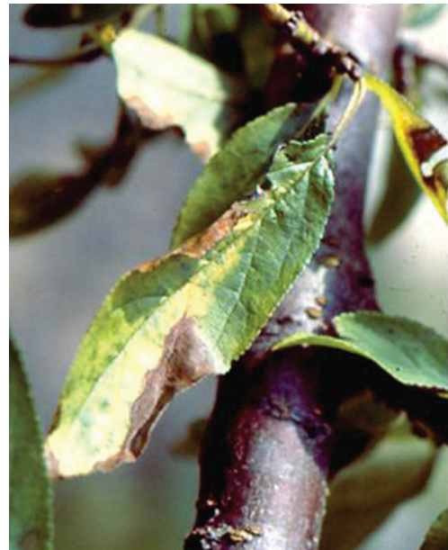
Figure 4. A plum leaf expressing symptoms of plum leaf scald disease.