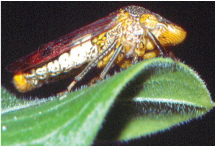
Figure 2. Homalodisca vitripennis , the glassy-winged sharpshooter, a major vector of Xylella fastidiosa .