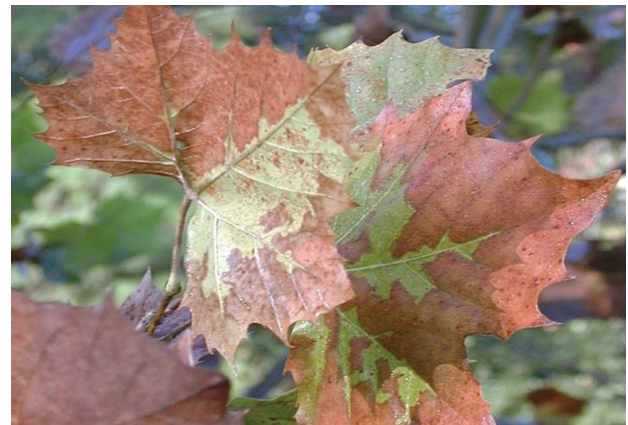
Figure 5. A sycamore leaf expressing symptoms of sycamore leaf scorch.

Leaf scorches occur with similar symptoms in plum and many ornamental trees including elm, oak, sycamore, and maple. Often the leaves will appear normal early in the season, but later develop a tan discoloration beginning at the leaf margin that spreads in an uneven band toward the midrib and base of the leaf. The dead leaf tissue is separated from living green tissue by a narrow but distinct yellow border or halo (Figure 5). Disease will often stress and weaken the tree, predisposing it to attack from insects and fungi. Although it requires several years for the bacterium to kill trees, branch dieback and tree death eventually occurs, depending on the vigor of the tree. The occurrence of leaf scorch has increased to epidemic levels in the last 10-15 years in the middle-Atlantic states where it is destroying valuable large shade trees. Sycamore leaf scorch is particularly devastating because, in addition to affecting shade trees, it prohibits the development of sycamore plantations for fiber production.