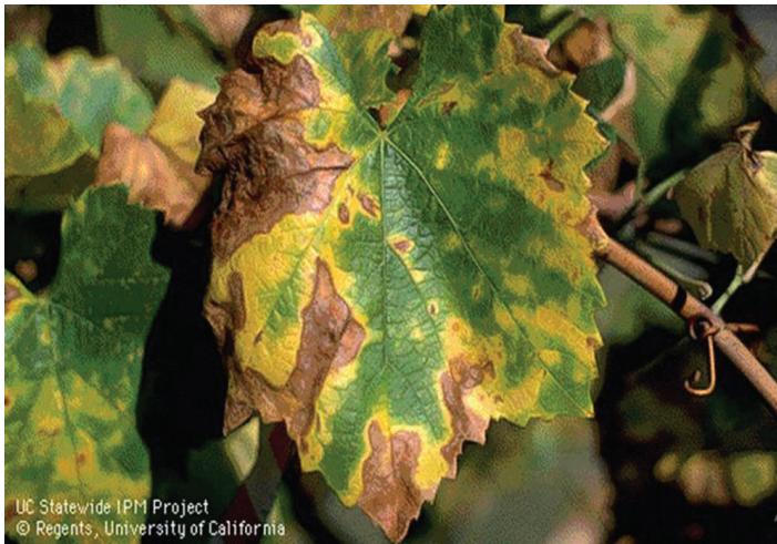
Figure 6. A grape leaf expressing symptoms of Pierce's disease.

Pierce's disease has been the limiting factor in bunch grape production in Florida. The pathogen can be transmitted by grafting but natural spread is through the feeding activities of leafhopper vectors. Symptoms are quite varied but involve a general loss in plant vigor followed by death of part or the entire vine. Specific symptoms include delayed leafing in the spring, shoot dwarfing, marginal scalding of leaves, leaf mottling and interveinal chlorosis and necrosis, wilting and premature coloring of fruit, uneven maturity of canes, and eventual death of the root system (Figure 6). Different species and cultivars of grapes have a range of tolerance to PD. High susceptibility of premium wine grapes ( Vitis vinifera ) has virtually excluded a wine industry in Florida. Many muscadine grapes, however, are resistant to PD. Although X. fastidiosa will inhabit the xylem vessels of these cultivars, disease symptoms will not be expressed. Because of the range of susceptibility of grapes to X. fastidiosa , great care should be taken in selection of resistant cultivars (see below).