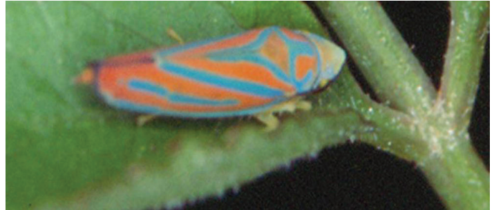
Figure 7. A leafhopper, Graphocephala sp., that vectors Xylella fastidiosa .

structures that are part of the mouthparts. Once the insect has acquired the bacteria, it can be spread to subsequent plants simply by feeding. Adult leafhoppers apparently remain infectious for life. Leafhoppers feed and oviposit (lay eggs) on an extremely wide range of plant species, but the adults and nymphs (Figure 8) have different nutritional requirements. The number of plant species that enable complete leafhopper nymph development is much lower than the number of adult feeding hosts. Adult leafhoppers are strong fliers and can find and feed on hosts over a large area during their long lifetime. In mark-recapture experiments, H. vitripennis was found capable of moving at least 180 m in a two hour period.