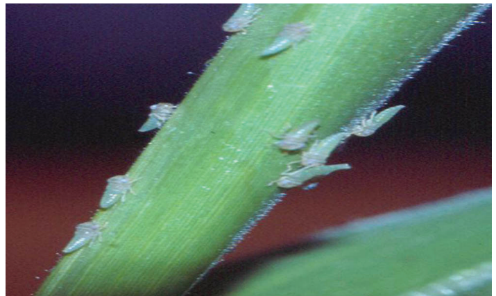
Figure 8. Nymphs of the leafhopper vector, Homalodisca insolita .

Over-wintering adults of H. vitripennis do not hibernate, but their wintering behavior is not well understood. In winter, they feed on oaks, hollies and perhaps other hosts, and fly during warm spells. Leafhoppers infected with X. fastidiosa have been collected almost every month of the year in Florida. The acquisition of the X. fastidiosa bacteria appears to have no effect on the insect vector.