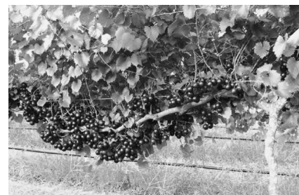
Fig. 1. ‘Delicious’ muscadine grape.

In taste, texture, and dry stem scar percentage, ‘Delicious’ compares favorably with