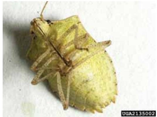
Figure 4. Ventral view of adult female brown stink bug, Euschistus servus (Say).

The eggs are yellowish-translucent, but their color starts turning toward a light pink before hatching.