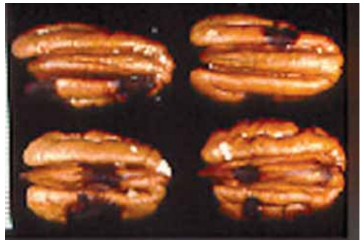
Figure 1. View of kernel spots on four nuts caused by feeding from the brown stink bug, Euschistus servus (Say).

Under drought conditions, the bugs may attack fruit in much higher numbers. In peaches, stink bugs are also called catfacing insects because, after the tissue is injured, the surrounding, healthy plant tissue continues to grow, resulting in a scar that resembles a cat's face. It should also be noted that other stink bug species may also cause similar damage in central and south Florida peach. In pecans, they are termed kernel feeding insects because they injure the nut kernels by feeding, with most injury occurring in late season.