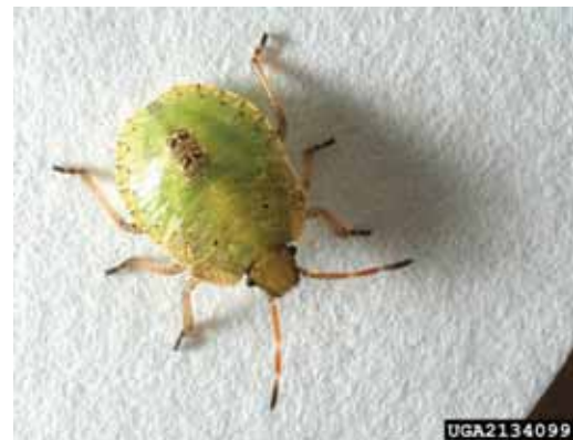
Figure 10. Fourth instar nymph of the brown stink bug, Euschistus servus (Say).