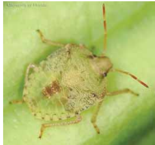
Figure 11. Fifth instar nymph of the brown stink bug, Euschistus servus (Say).

Each female oviposits about 18 egg masses, averaging 60 eggs, over a period of >100 days. Approximately four to five weeks are required from hatching to adult emergence. Euschistus servus have as many as four to five or more generations per year in Florida. Adults are strong fliers and will readily move between weeds and other alternate hosts.