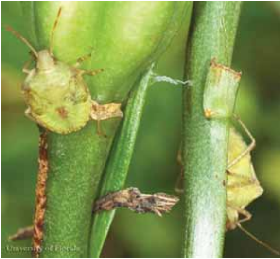
Figure 12. Nymph (left) and adult (right) brown stink bug, Euschistus servus (Say).