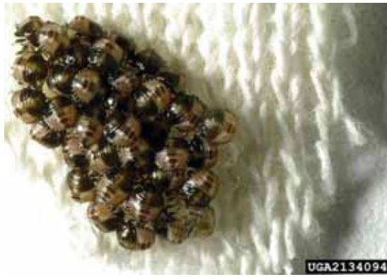
Figure 7. First instar nymphs of the brown stink bug, Euschistus servus (Say).