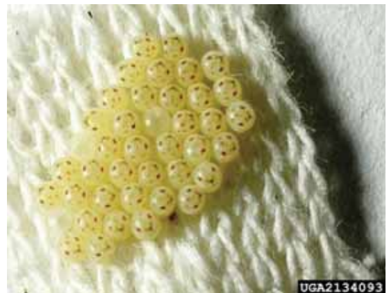
Figure 6. Five-day-old egg mass of the brown stink bug, Euschistus servus (Say).