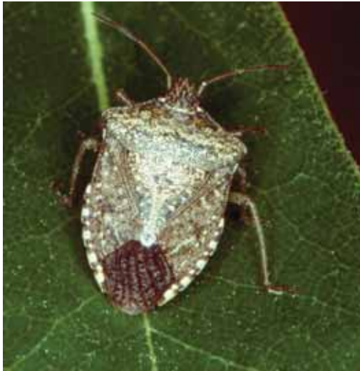
Figure 2. Adult brown stink bug, Euschistus servus (Say).

The fourth and fifth antennal segments are darker in color. The ventral surface usually has a pinkish tinge. Cheeks are large, passing the clypeus in length and more pointed. The humeral angles of the pronotum are rounded. The body length varies from 10 to 15 mm for adults.