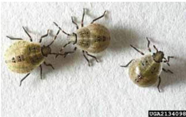
Figure 9. Fed third instar nymphs of the brown stink bug, Euschistus servus (Say).