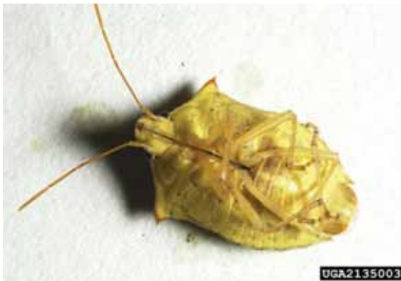
Figure 3. Ventral view of adult male brown stink bug, Euschistus servus (Say).