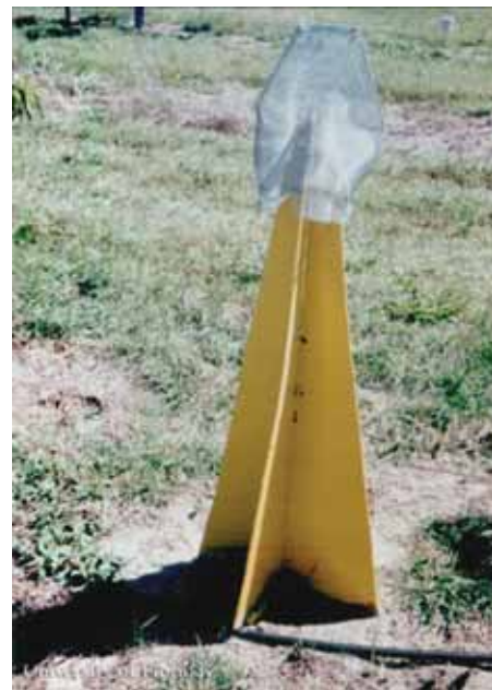
Figure 13. Florida stink bug trap.

Monitoring can be done by direct tree examinations and fruit damage counts. Beating tray sampling, sweep sampling and using the Florida Stink Bug Trap with the aggregation pheromone are also ways of monitoring and capturing them. Trap crops of triticale, buckwheat, sorghum, millet, and sunflower may be grown on the exterior of gardens, orchards and other types of production areas to intercept the stink bugs before they enter the cash crop. Small growers may wish to grow the trap crops in large containers so that they can be easily moved to where they are needed.