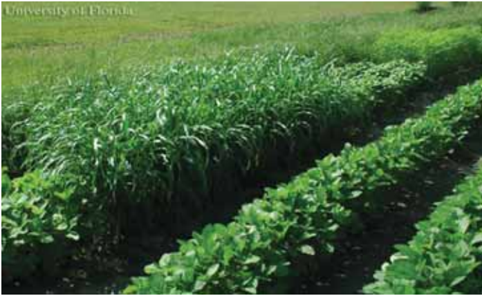
Figure 14. Trap crops for stink bugs.