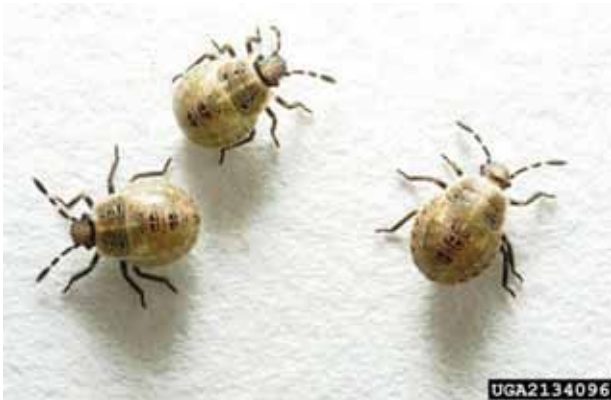
Figure 8. Fed second instar nymphs of the brown stink bug, Euschistus servus (Say).